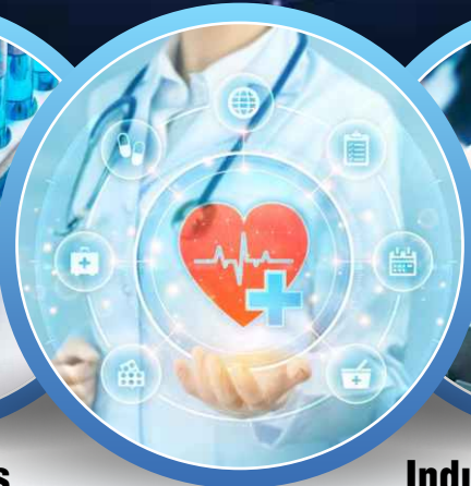
Healthcare & Pharmaceuticals