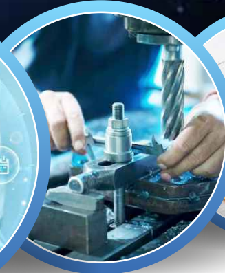
Industrial Tools & Machinery