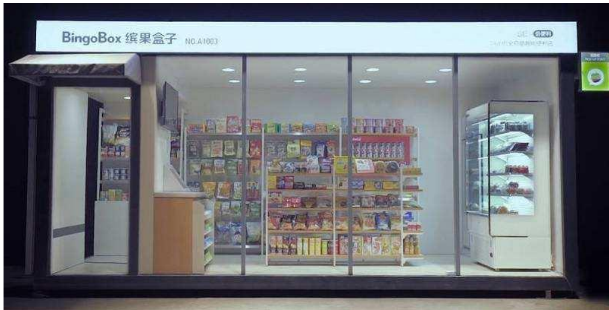
BingoBox Unmanned Self-Checkout Store

The 15 th China Vending and Self-Service Show runs from 26 th to 28 th April 2018 (9am – 5:30pm).