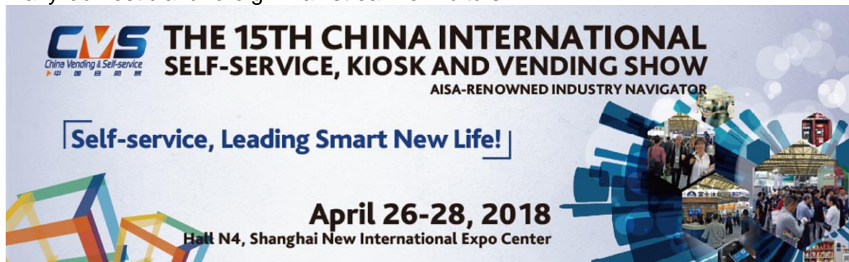
The 15 th China International Self-service, Kiosk and Vending Show

With our successful history and professional approach, the CVS continues to attract many domestic and foreign mainstream exhibitors.