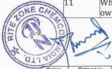
Table I - Summary Statement holding of specified securities