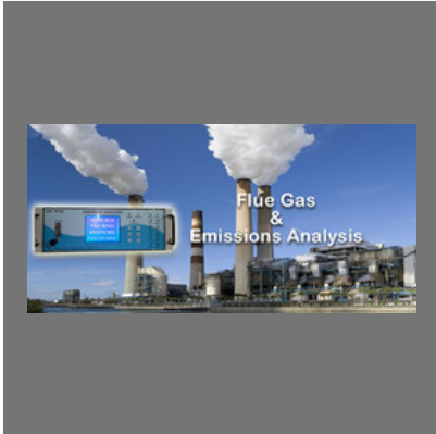
Online Continuous Stack Emissions Monitoring Systems