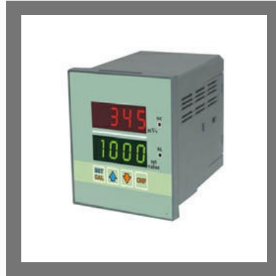
Online PH Indicator