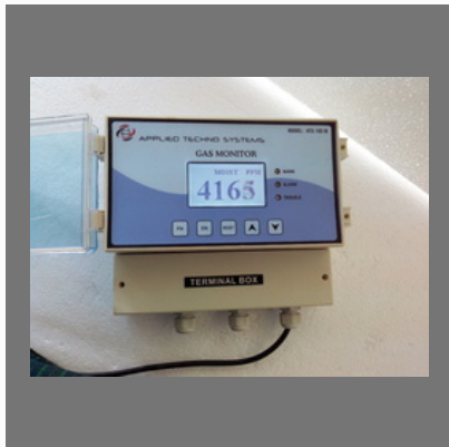
Online Dew Point Meter