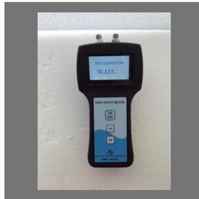
Portable Hydrogen Gas Leak Monitor