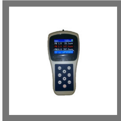
Portable Dust Monitor