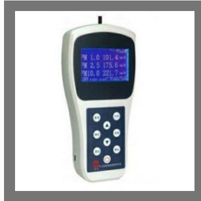
PM 2.5 Monitor