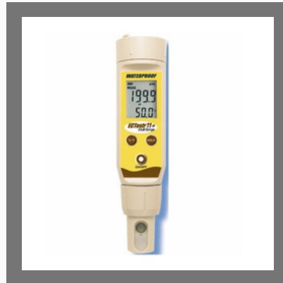
TDS (Total Dissolved Solid )Meter