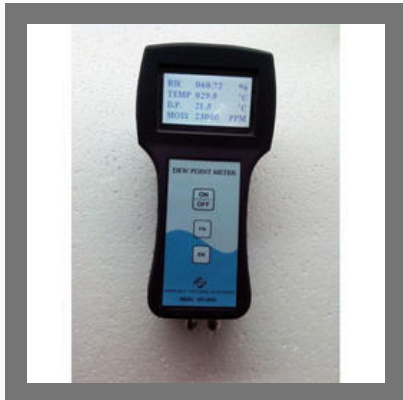
Portable Dew Point Monitor