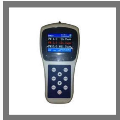
Portable Gas Analyzer