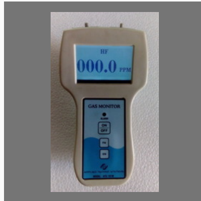
confined Space Oxygen Gas Leak Monitor