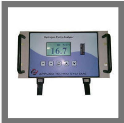
Methane Gas Analyser