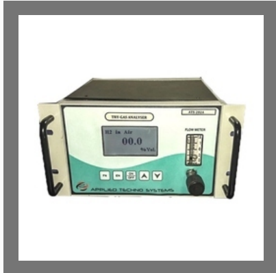
Portable Biogas Analyzer