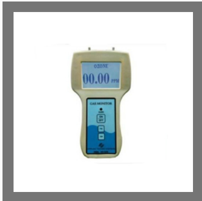
Portable Ozone Gas Leak Detector