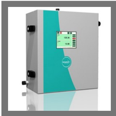
Online Effluent Monitoring Systems