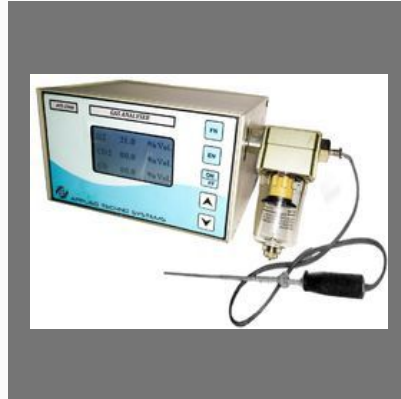
Flue Gas Analyzer