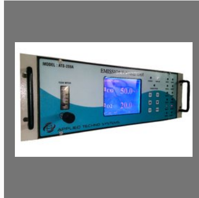
Online SOx Gas Analyzer