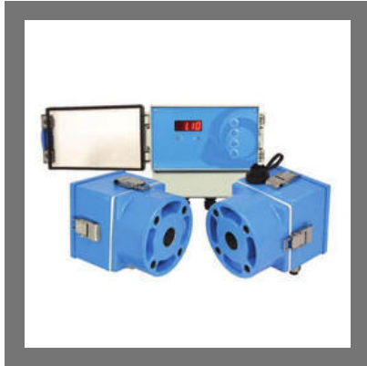
Dust Opacity Monitor