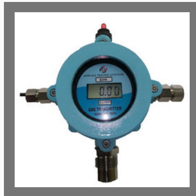
Oxygen Gas Sensor Transmitter