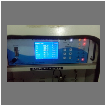
Gas Analyzer with Real Time Data Transmission