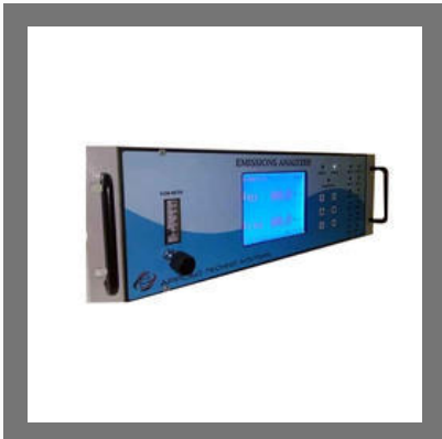
Online Gas Analyzer