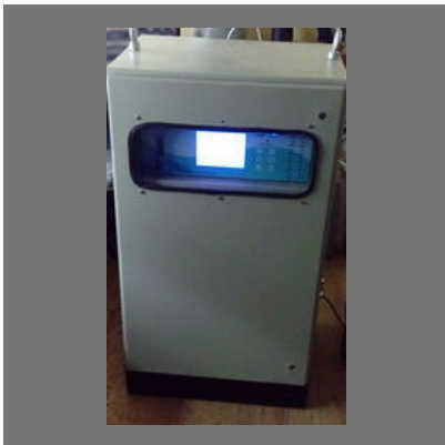
Online SOX and NOX Analyzer