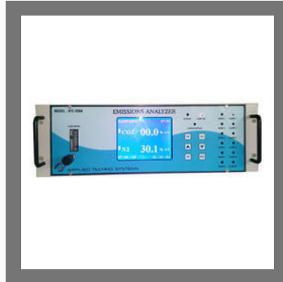
Stack Emission Monitoring Systems