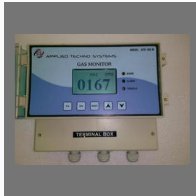
Online H2S Gas Leak Detector