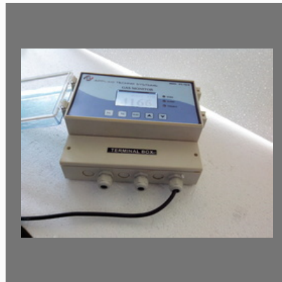
Dew Point Meter