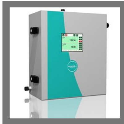
Real Time Online Effluent Monitoring Systems