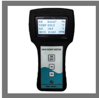
Handheld Dew Point Meter