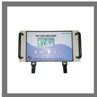
Flue Gas Analyser