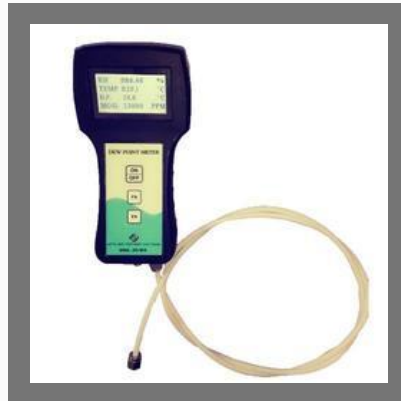
Portable Dew Point Meter