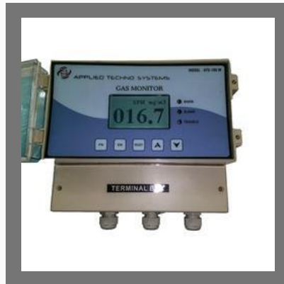
Online Stack PM Analyzer