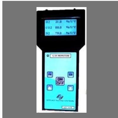
Portable Multi Gas Leak Monitor