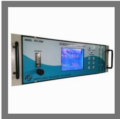
Online Stack Gas Analyzer