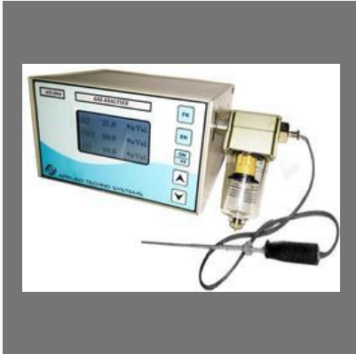
Exhaust Gas Analyzer