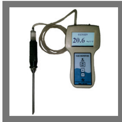
Handheld Oxygen Analyzer