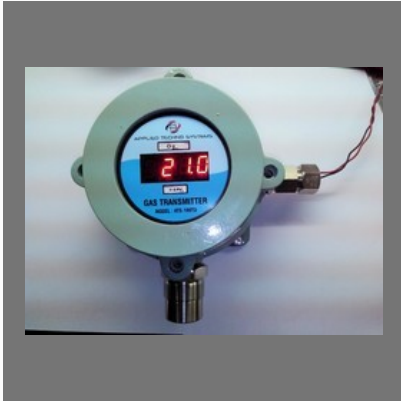
Combustible Gas Sensor