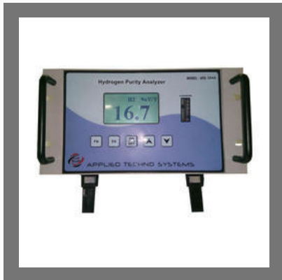
Hydrogen Purity Analyser