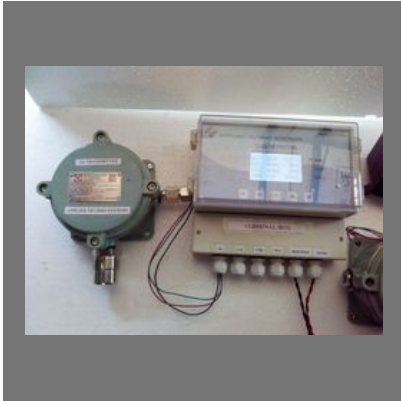
Gas Leak Detector