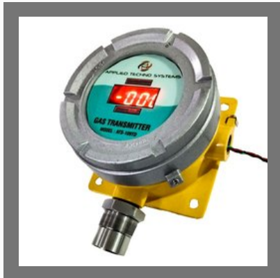
Dew Point Transmitter