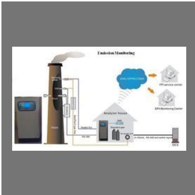
Online Continuous Emissions Monitoring Systems (OCEMS)