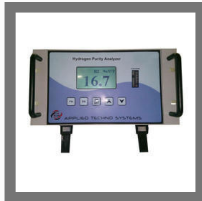
Portable Oxygen Purity Analyzer