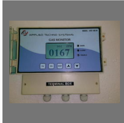
Online SO2 Gas Leak Detector