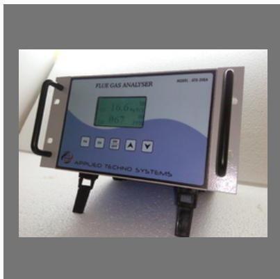
Stack Gas Analyzer