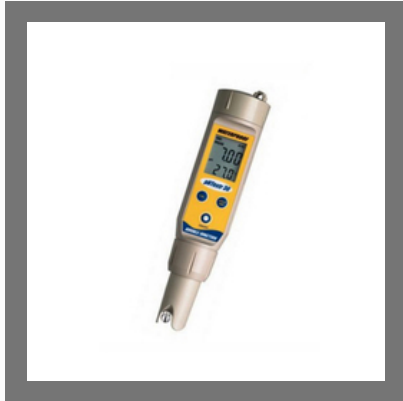
PH Meter For Laboratory