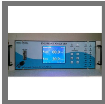
Stack Gas Analyzer