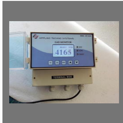
Digital Online Dew Point Analyzer