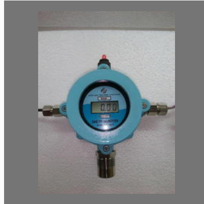
LEL Gas sensor Transmitter