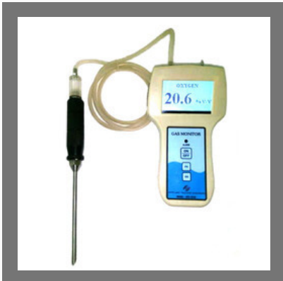
Fuel Efficiency Analyzer