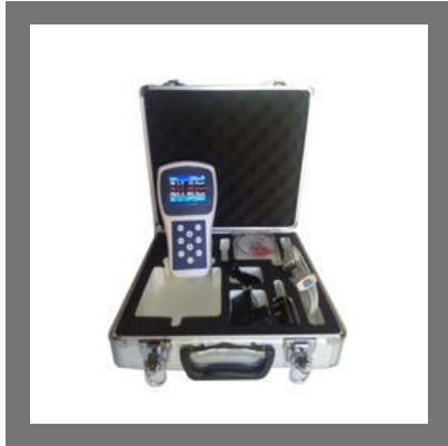
Air Quality Monitor