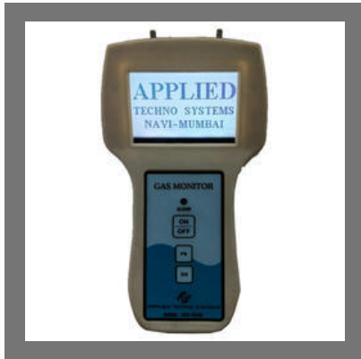
Portable Gas Leak Detector/Monitor