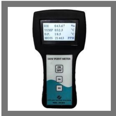
Portable Dew Point Meter