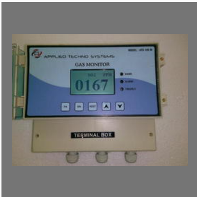
SO2 Gas Leak Monitor