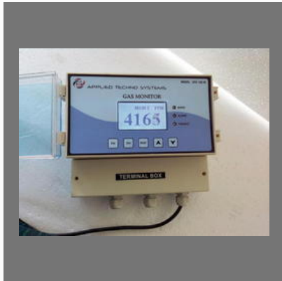
Digital Online Dew Point Meter