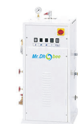
Electrical Steam Boiler