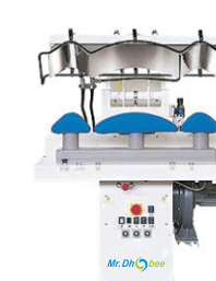
Collar & Cuff Press