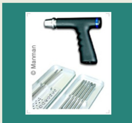
Reaming Handpiece Autoclavable