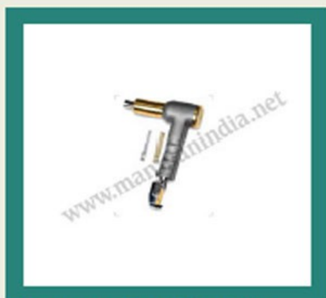
Sternum Saw Electric