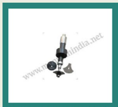
Resternotomy Saw (Redo Saw)

We are an ISO certified manufacturer & wholesaler of extensive array of Cardiac Surgery Equipments . Our complete array consists of Manman Driving Unit(Code A), Manman Sternum Saw(Electrical) (Code O) & Manman Resternotomy Saw (Electrical) (Code P).