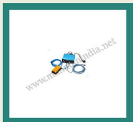
Power Console And Foot Control

We are highly acclaimed as the manufacturers and suppliers of Pediatric Plastic Surgery Instruments and Pediatric Plastic devices . These devices are made as per the design and size specifications of the customers. Our range is made in strict conformity to the international quality standard.