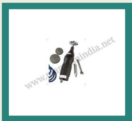
Plaster Cutter Electrical

We are one of the prominent manufacturers and suppliers of wide range of Orthopedic Surgical Instruments and Ortho Surgery appliances . Our range is used in all types of orthopedic treatments. We make our entire array of orthopedic instruments as per the safety and comforts requirements of the patients.