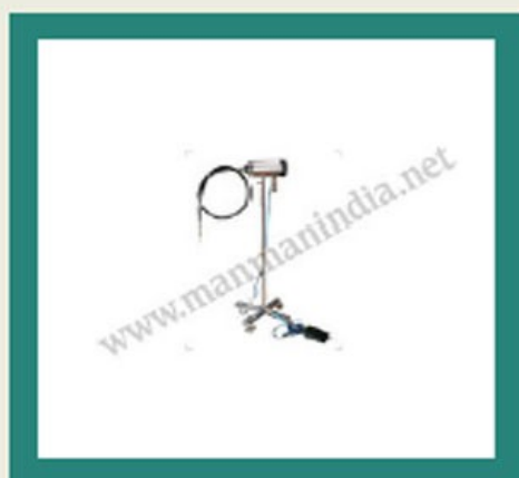
Driving Unit (Neuro)