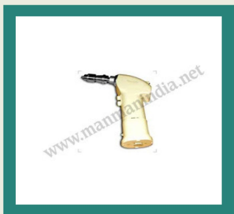
Battery Operated Bone Drill