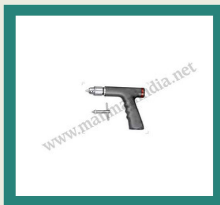
Bone Drill Handpiece