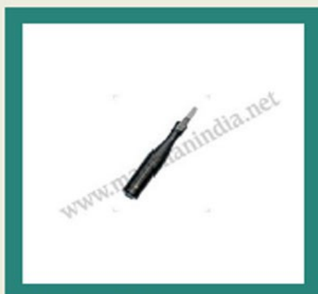
Mini Sagital Saw