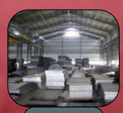
Precision Steel Sheets