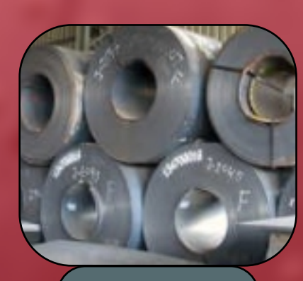
Durable Hr Coils