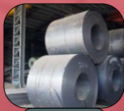
Durable Hot Rolled Coils