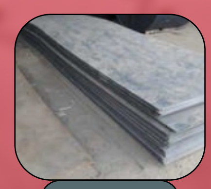
Steel Graded Sheets