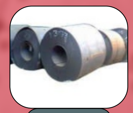
Hot Rolled Coils