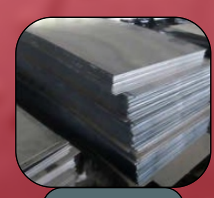
Industrial Steel Sheets