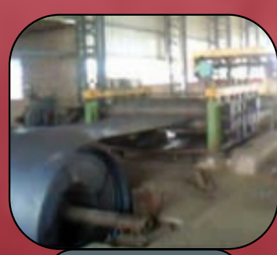
Steel Coil Cutting Services