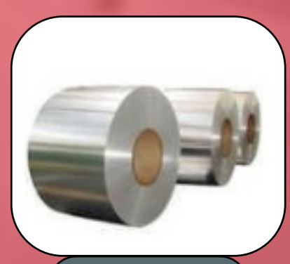
Precision Hot Rolled Coils