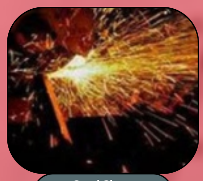
Steel Sheet Cutting Services