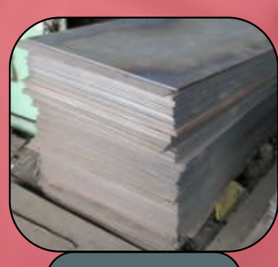
Industrial Steel Plates