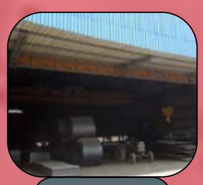
Heavy Duty Steel Sheets