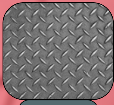
MS Chequered Plate