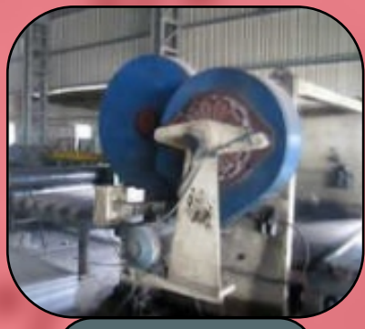
HR Coil Cutting Services