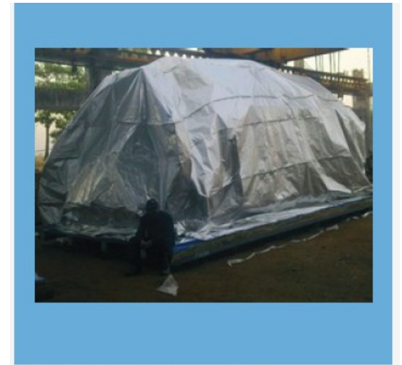
PVC Container Covers