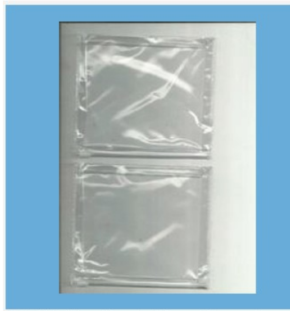
PVC Coated Gas Digester Bags