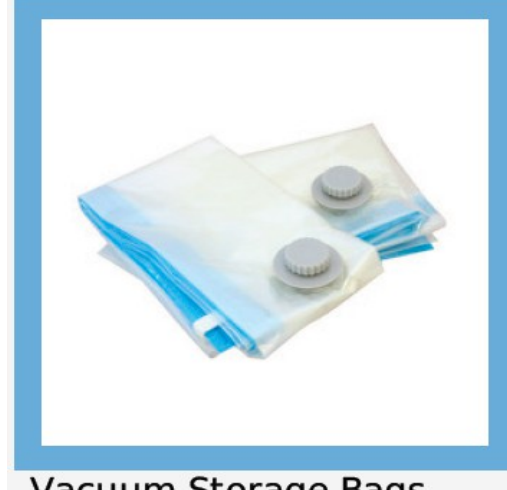
Vacuum Storage Bags