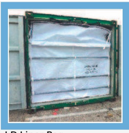
LD Liner Bag