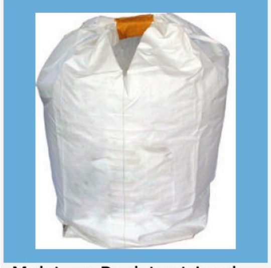
Moisture Resistant Jumbo Bags Liners