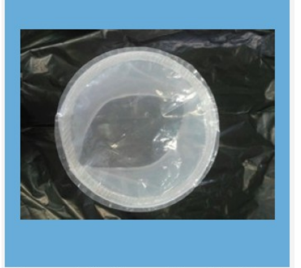
Round Bottom Plastic Bags