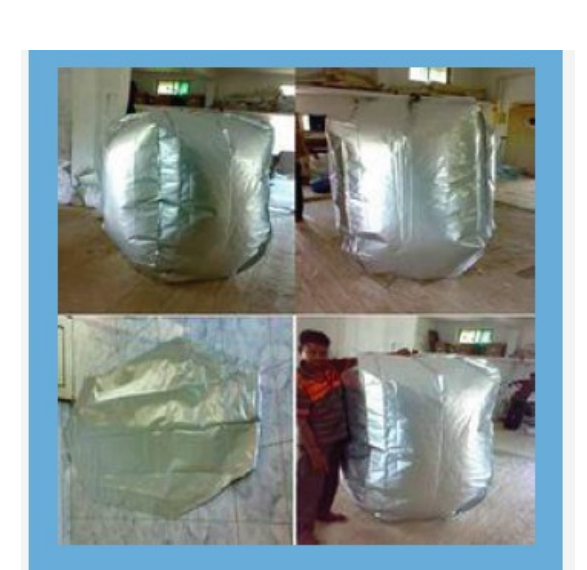
Aluminum Multilayered Jumbo Bag