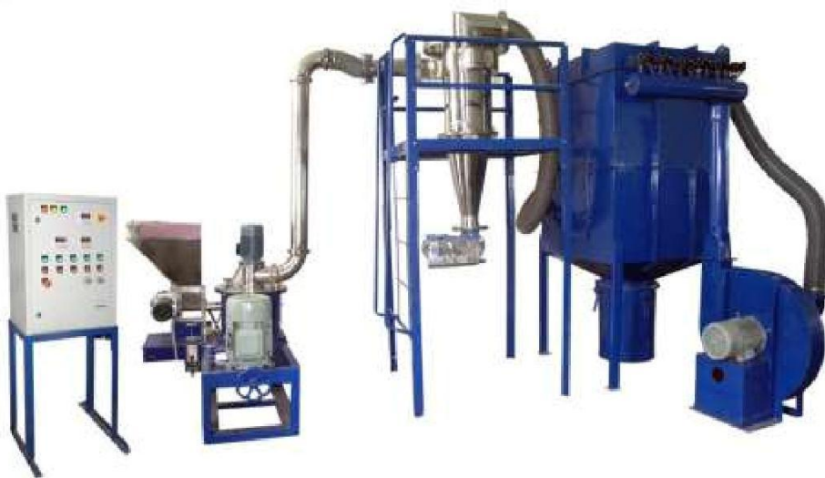
ACM GRINDING MILL MPT-20