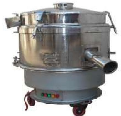
SIFTER-36 (SIEVING MACHINE)