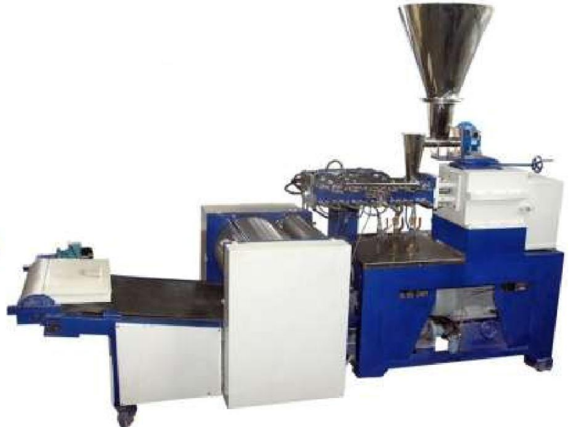
TWIN SCREW EXTRUDER MPT55PC WITH CHILL ROLL & FLAKER