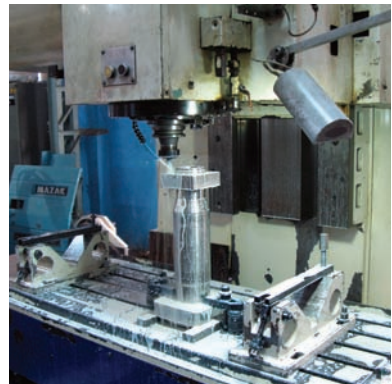
► Applying international standards in lubrication & machining techniques.

nishant.kashyap@infomedia18.in tarun.tampi@infomedia18.in