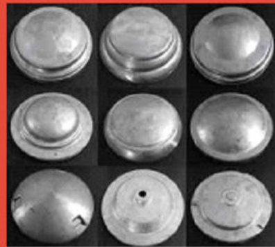
Die Casting Moulds