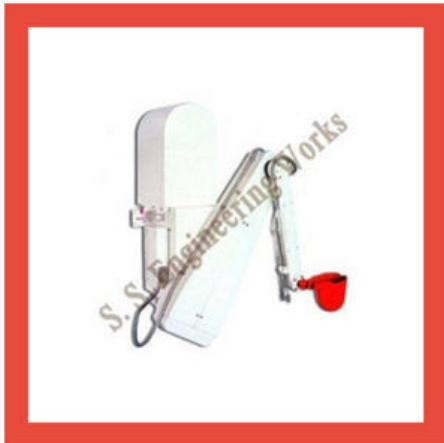
Automatic Ladling Machine