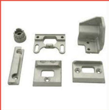
Aluminium Die Casting