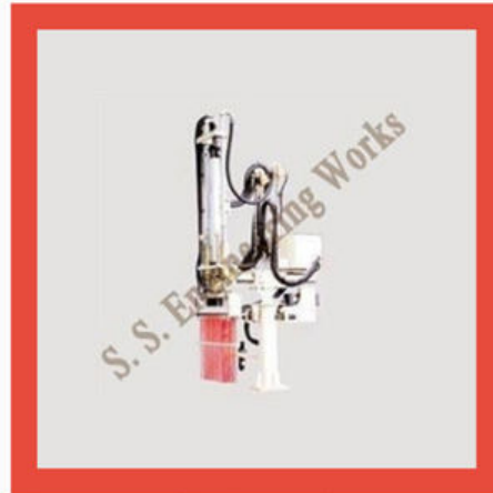
Automatic Spraying Machine