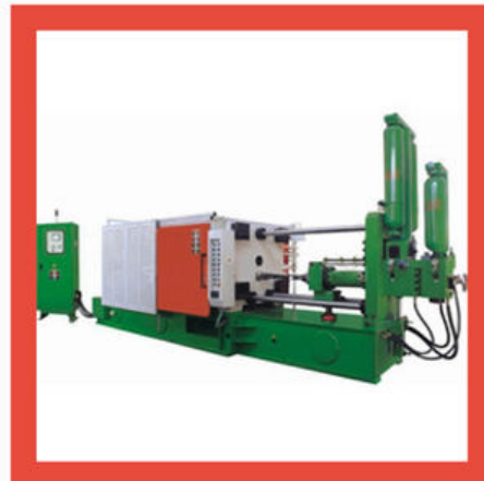
Cold Chamber Die Casting Machine