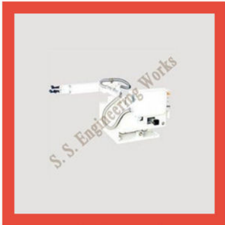
Automatic Extracting Machine