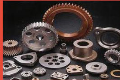
Aluminium Die Castings