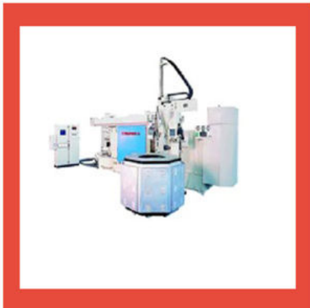
Pressure Die Casting Machines