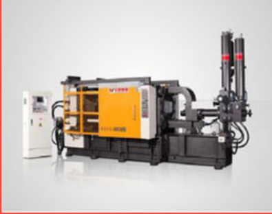
Aluminium Pressure Die Casting Machine