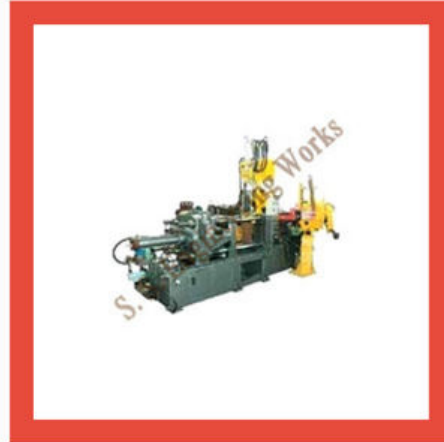
400 Tons to 1100 Tons Die Casting Machine