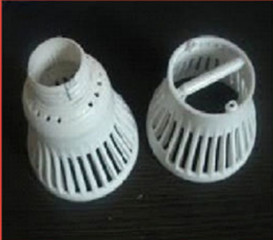
Die Casting Moulds And Dies