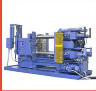
High Speed Aluminum Die Casting Machine