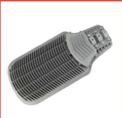
Metal Die Casting