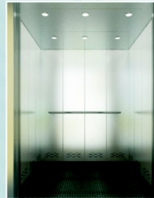
SS Elevator Cabin