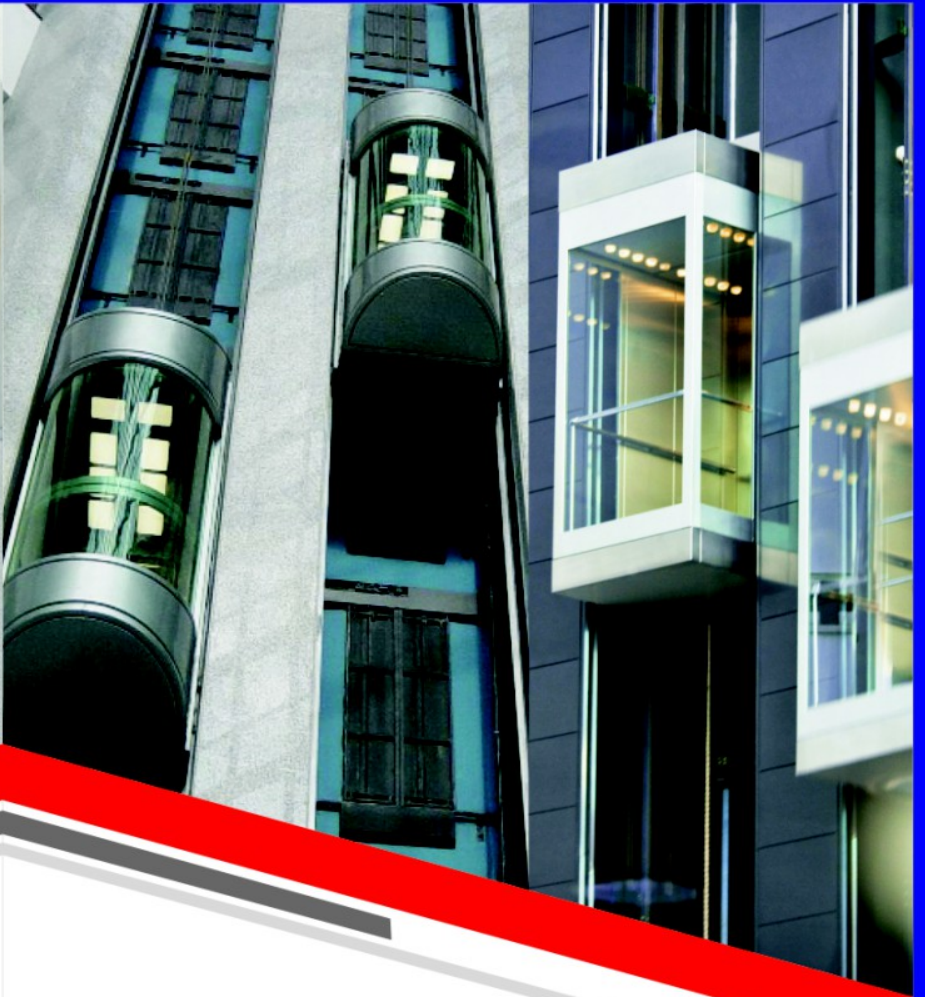
Load Capacity & Dimensions of Manually Door Operation Passenger Lift Speed 0.63 M.P.S.