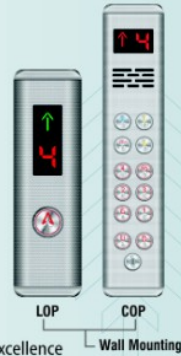
LOP COP Wall Mounting