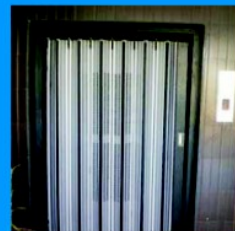
M S Imperforated Door