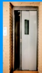
Telescopic Door with Frame