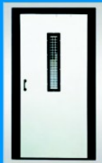
M. S. Swing Door with Frame