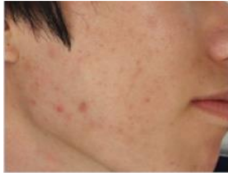
After 4Rx (20 Weeks)

F = 45 J/cm 2 X 4 times (4weeks interval)