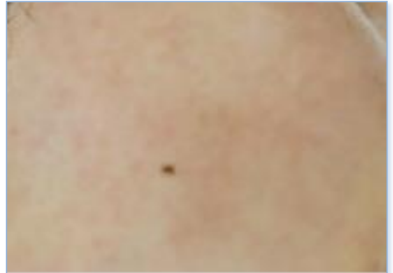
After 4Rx (20 Weeks)

F = 55 J/cm 2 X 4 times (4weeks interval)