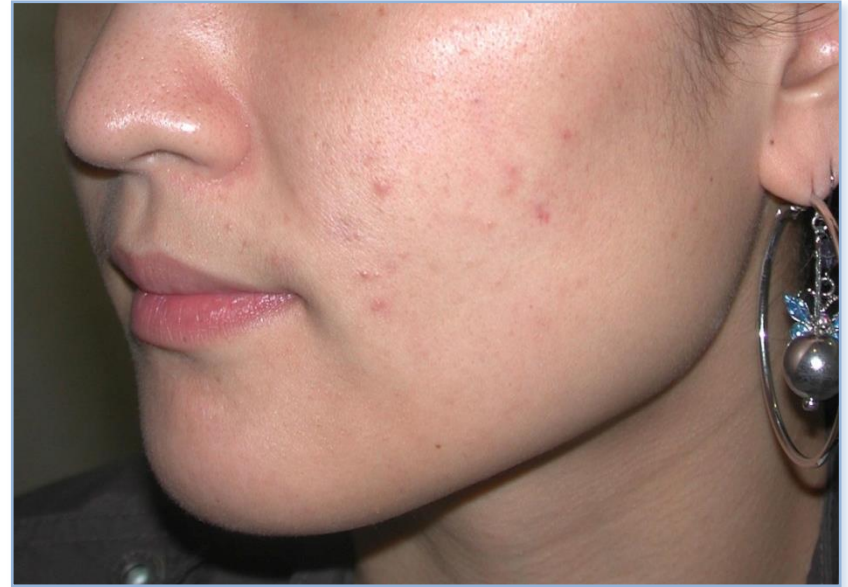
After 4Rx (20 Weeks)

F = 55 J/cm 2 X 5 times (4weeks interval)