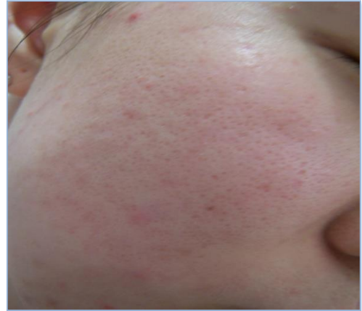
After 4Rx (12 Weeks)

F = 45 J/cm 2 X 4 times (4weeks interval)