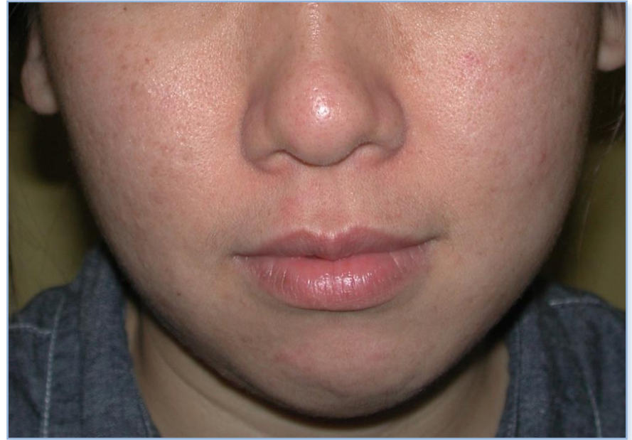
After 4Rx (16 Weeks)

F = 55 J/cm 2 X 5 times (4weeks interval)