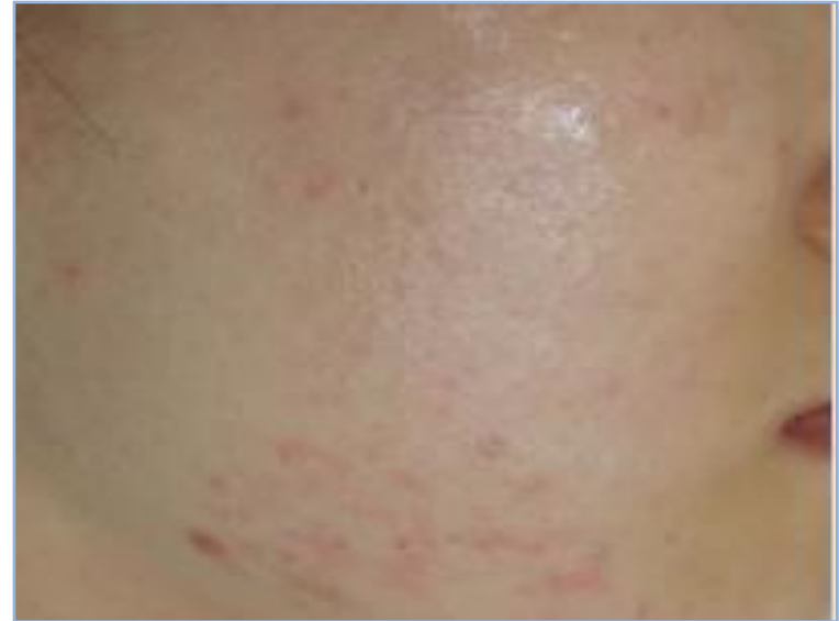
After 4Rx (20 Weeks)

F = 45 J/cm 2 X 4 times (4weeks interval)