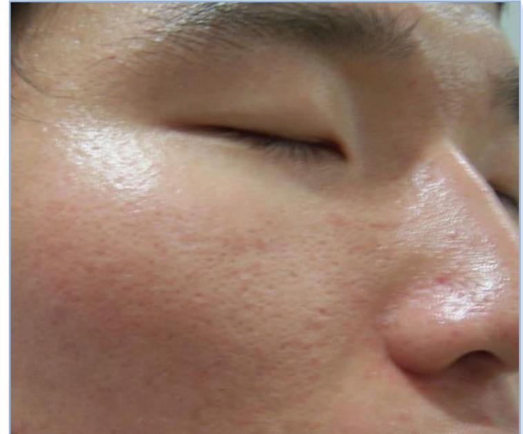
After 4Rx (12 Weeks)

F = 55 J/cm 2 X 5 times (3weeks interval)