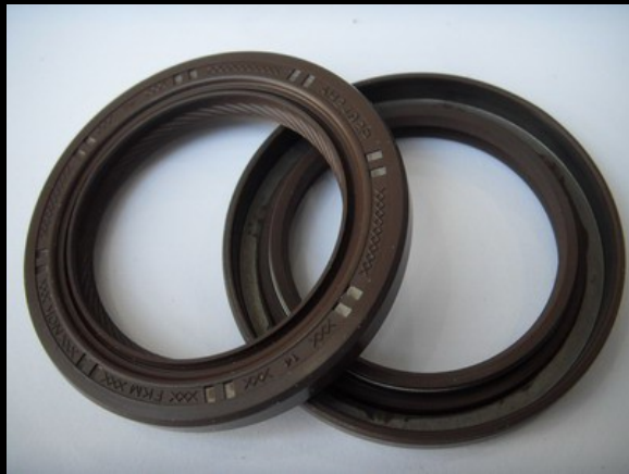
Hydro Testing Seal