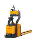
Auto Pallet Mover ERE 225a max. lift height: 122 mm max. capacity: 2,500 kg