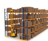
Single bay racking

For perfect teamwork: trucks and racking from one supplier.