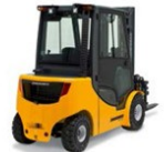
Diesel/LPG fork lift truck hydrostatic DFG/TFG 425s-435s max. lift height: 7,000 mm max. capacity: 3,500 kg