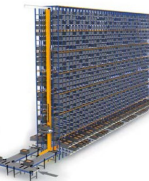
Automatic small parts storage