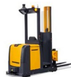
Auto Pallet Mover EKS 210a max. lift height: 3,000 mm max. capacity: 1,500 kg