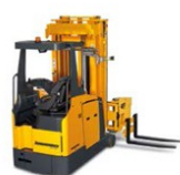
Tri-lateral stacker ETX 513-515 max. lift height: 13,000 mm max. capacity: 1,500 kg Optional with warehouse navigation