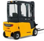
Electric 4-wheel counterbalance truck EFG 316-320 max. lift height: 6,500 mm max. capacity: 2,000 kg