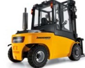
Diesel/LPG fork lift truck hydrodynamic DFG/TFG 660-590 max. lift height: 8,000 mm max. capacity: 9,000 kg