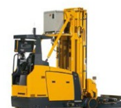
Automatic very narrow aisle truck ETXa max. lift height: 13,000 mm max. capacity: 1,500 kg

In addition, we offer trucks manufactured from stainless steel, in a cold store versions and explosion-proof fork lift trucks with a service to 100% customise a truck to your exact specification.