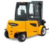
Electric 4-wheel counterbalance truck EFG 535k-550s max. lift height: 7,180 mm max. capacity: 5,000 kg