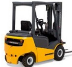
Diesel/LPG fork lift truck hydrodynamic DFG/TFG 316-320 max. lift height: 7,500 mm max. capacity: 2,000 kg