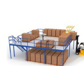
Mezzanine platform multi-tier shelving