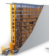
High bay racking