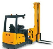
Tri-lateral stacker EFX 410-413 max. lift height: 7,000 mm max. capacity: 1,250 kg Optional with warehouse navigation