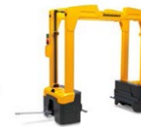
Portal-trailer with double-sided loading options GTP 110/210 max. capacity: 1,000 kg

We will be happy to advise you on the use of a tow tractor train.