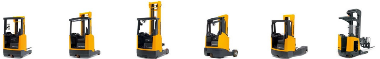
Reach truck ETV 110/112 max. lift height: 7,100 mm max. capacity: 1,200 kg Reach truck ETM/ETV 214/216 max. lift height: 10,700 mm max. capacity: 1,600 kg Reach truck ETM/ETV 318/320/325 max. lift height: 13,000 mm max. capacity: 2,500 kg Reach truck ETV C16/C20 max. lift height: 7,400 mm max. capacity: 2,000 kg Multi-way reach truck ETV O20/O25 max. lift height: 10,700 mm max. capacity: 2,500 kg Extended reach fork lift truck ETR 316d/318/320 max. lift height: 11,430 mm max. capacity: 2,000 kg