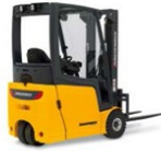
Electric 3-wheel counterbalance truck with front wheel drive EFG 213-220 max. lift height: 6,500 mm max. capacity: 2,000 kg