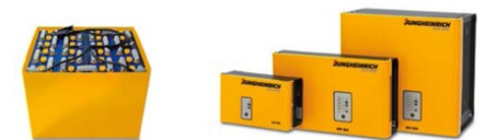
The correct battery for every fork truck application