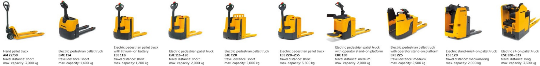
Hand pallet truck AM 22/30 travel distance: short max. capacity: 3,000 kg Electric pedestrian pallet truck EME 114 travel distance: short max. capacity: 1,400 kg Electric pedestrian pallet truck with lithium-ion battery EJE 112i travel distance: short max. capacity: 1,200 kg Electric pedestrian pallet truck EJE 116-120 travel distance: short max. capacity: 2,000 kg Electric pedestrian pallet truck EJE C20 travel distance: short max. capacity: 2,000 kg Electric pedestrian pallet truck EJE 220-235 travel distance: short max. capacity: 3,500 kg Electric pedestrian pallet truck with operator stand-on platform ERE 120 travel distance: medium max. capacity: 2,000 kg Electric pedestrian pallet truck with operator stand-on platform ERE 225 travel distance: medium max. capacity: 2,500 kg Electric stand-in/sit-on pallet truck ESE 120 travel distance: medium/long max. capacity: 2,000 kg Electric sit-on pallet truck ESE 220-533 travel distance: long max. capacity: 3,300 kg