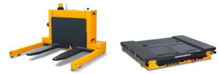
In Pallet Carrier IPC max. capacity: 1,200 kg