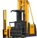
Order picker/tri-lateral stacker EKX 410 max. lift height: 10,500 mm max. capacity: 1,000 kg Optional with warehouse navigation