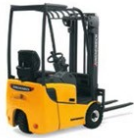
Electric 3-wheel counterbalance truck with rear wheel drive EFG 110-115 max. lift height: 6,500 mm max. capacity: 1,500 kg