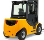
Diesel/LPG fork lift truck hydrostatic DFG/TFG 540s-550s max. lift height: 7,180 mm max. capacity: 5,000 kg