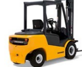
Diesel/LPG fork lift truck hydrodynamic DFG/TFG 425-435 max. lift height: 7,500 mm max. capacity: 3,500 kg