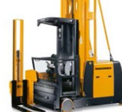
Order picker/tri-lateral stacker EKX 513-515 max. lift height: 17,000 mm max. capacity: 1,500 kg Optional with warehouse navigation