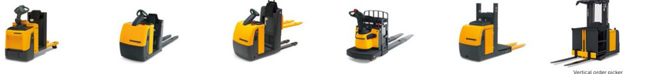
Low level order picker ECE 118 max. picking height: 1 st level max. capacity: 1,800 kg Low level order picker ECE 220/225 max. picking height: 2 nd level max. capacity: 2,500 kg Low level order picker ECE 310/320 max. picking height: 2 nd level max. capacity: 2,000 kg Low level order picker ECR 327/336 max. picking height: 1 st level max. capacity: 3,600 kg Vertical order picker EKS 110 max. picking height: 4,600 mm max. capacity: 1,000 kg Vertical order picker EKS 210/312 max. picking height: 11,345 mm max. capacity: 1,200 kg Optional with warehouse navigation