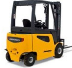
Electric 4-wheel counterbalance truck EFG 425-530s max. lift height: 7,000 mm max. capacity: 3,000 kg