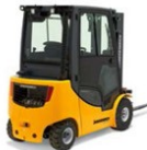
Diesel/LPG fork lift truck hydrostatic DFG/TFG 316s-320s max. lift height: 6,500 mm max. capacity: 2,000 kg