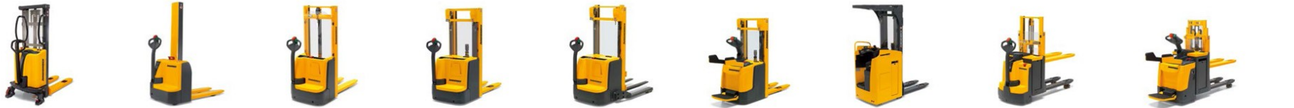
Electric hand stacker HC 110 max. lift height: 3,000 mm max. capacity: 1,000 kg Electric pedestrian stacker EMC 110 max. lift height: 2,000 mm max. capacity: 1,000 kg Electric pedestrian stacker EJC 110-112 max. lift height: 3,600 mm max. capacity: 1,200 kg Electric pedestrian stacker EJC 212-220 max. lift height: 5,350 mm max. capacity: 2,000 kg Electric pedestrian straddle stacker EJC B12-B20 max. lift height: 5,350 mm max. capacity: 2,000 kg Electric pedestrian stacker with operator stand-on platform ERC 212-220 max. lift height: 5,350 mm max. capacity: 2,000 kg Electric sideways seat stacker ESC 214-316 max. lift height: 5,350 mm max. capacity: 1,600 kg Electric pedestrian lift truck/stacker for double deck loading EJD 220 max. lift height: 2,560 mm max. capacity: 2,000 kg Electric pedestrian lift truck/stacker with operator platform for double deck loading ERD 220 max. lift height: 2,560 mm max. capacity: 2,000 kg