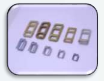
GI Wire Buckles