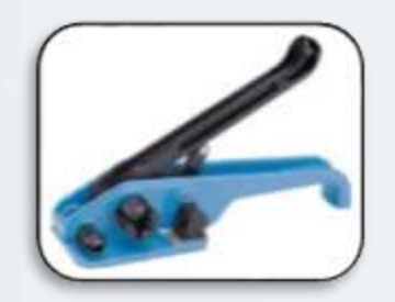
Strapping Tensioner Tools