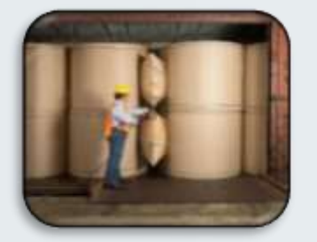
Dunnage Air Bag