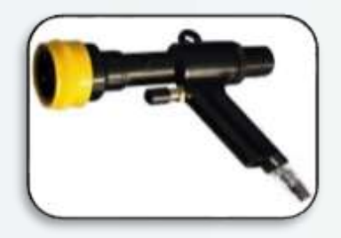
Dunnage Air Gun