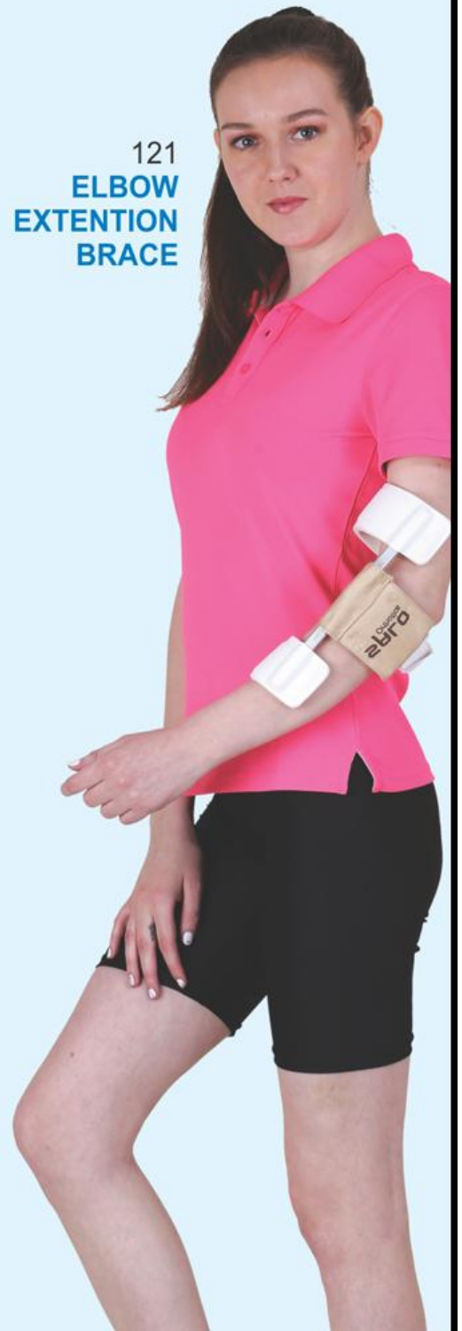
121 ELBOW EXTENTION BRACE

CE ISO 9001 : 2008 Certified ISO 13485 : 2003 Certified W.H.O-G.M.P Certified