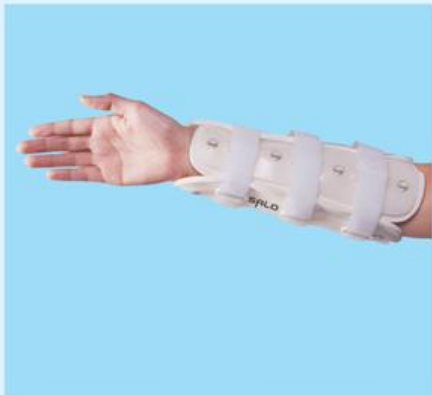
207 FOREARM BRACE