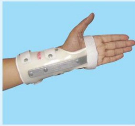
205 COCK-UP WRIST SPLINT (NEUTRAL/EXTENSION)