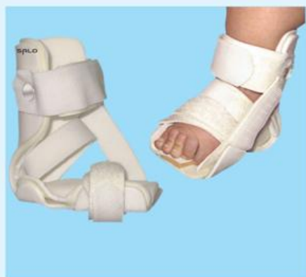
112 CTEV SPLINT