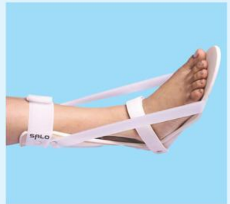
102 A STATIC FOOT DROP SPLINT