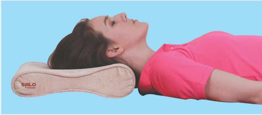
401 CERVICAL PILLOW DOUBLE CONTOUR