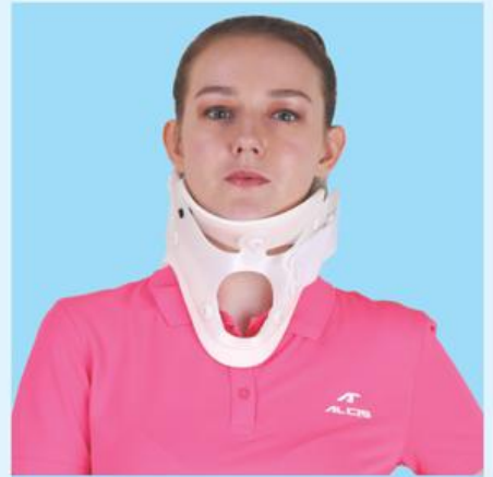
212 AMBULANCE COLLAR