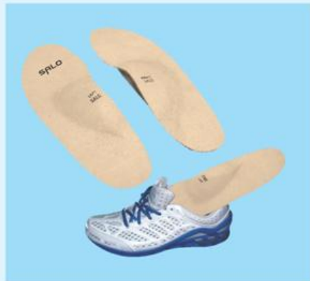
105 ARCH INSOLE SUPPORT