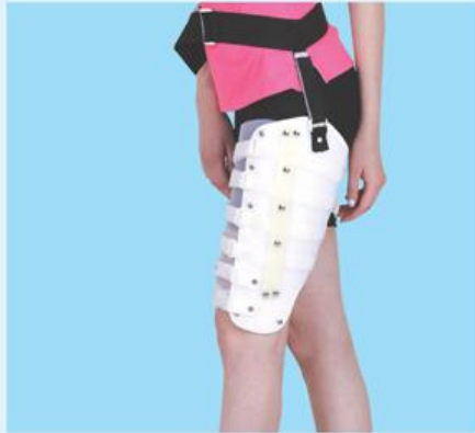
117 FEMORAL BRACE