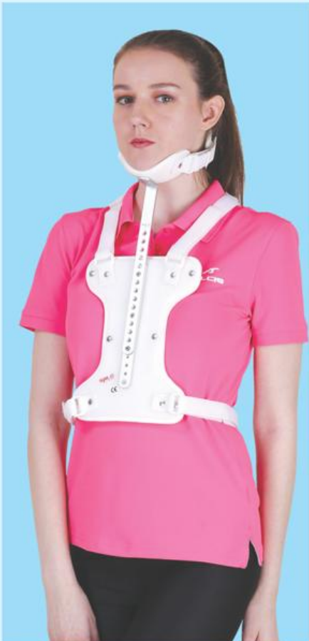
211 SOMI BRACE ANTERIOR / POSTERIOR ADJUSTABLE