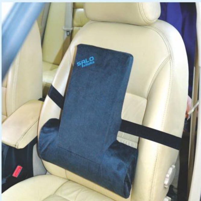
409 SPINE LUMBAR BACK REST T-SHAPED