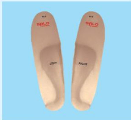
106 ARCH WITH C&E HEEL