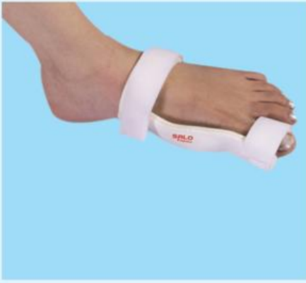
114 A HALLUX VALGUS SPLINT