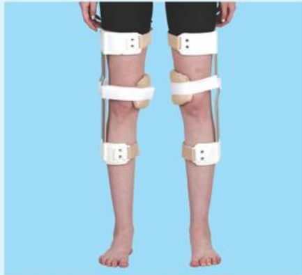
119 KNEE VALGUM BRACE