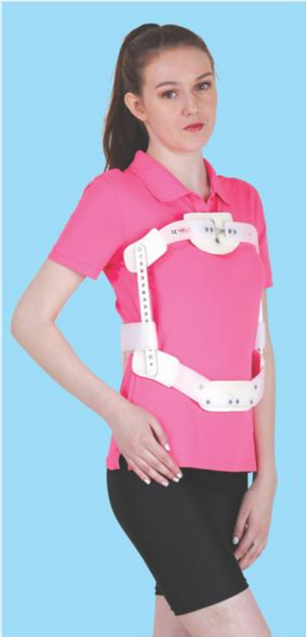
203 TL50 HYPER EXTENSION (JEWETT BRACE)