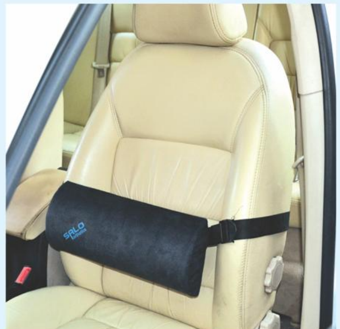
410 SPINE LUMBAR ROLL D-SHAPED