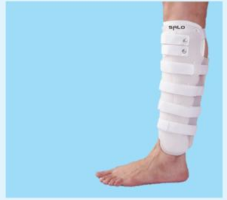
115 PTB BRACE