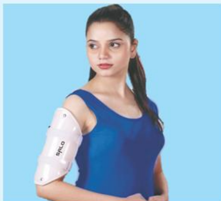
201 HUMERUS BRACE