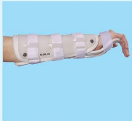
208 FOREARM BRACE WITH WRIST