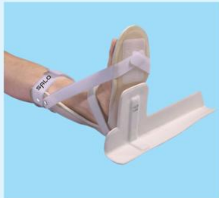
102 B FOOT DROP SPLINT WITH DETACHABLE BAR