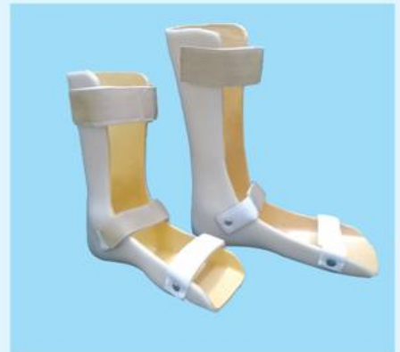
104 STATIC AFO