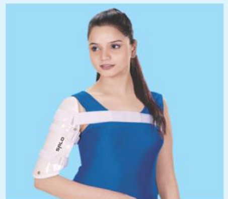
202 HUMERUS BRACE HIGH UP