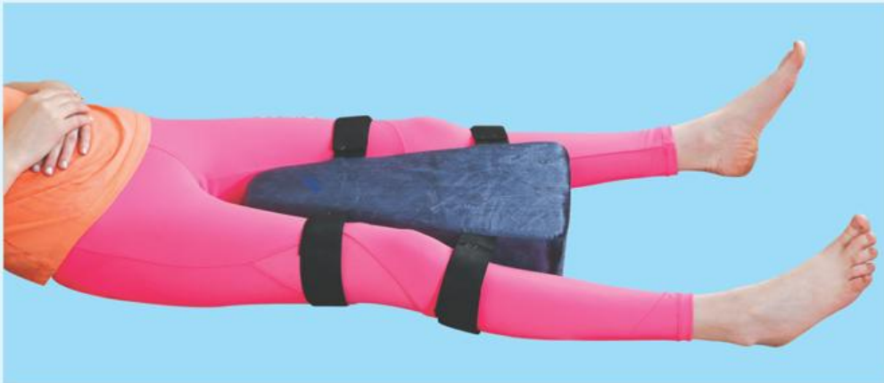
411 HIP ABDUCTION PILLOW