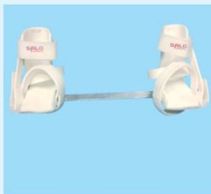
112 A DENNIS BROWN SPLINT