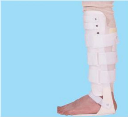
116 PTB WITH FOOT PLATE BRACE