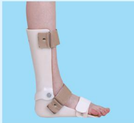
103 ARTICULATED AFO