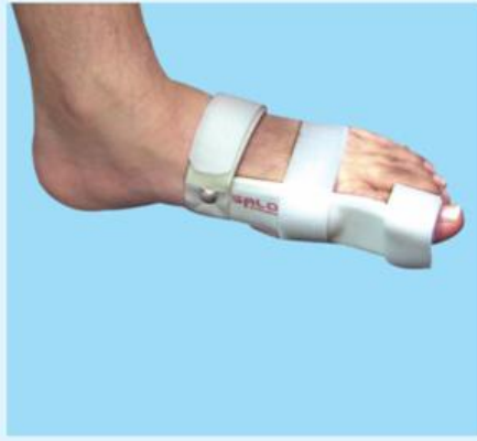
114 B HALLUX VARUS SPLINT