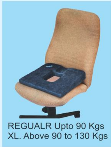
REGUALR Upto 90 Kgs XL. Above 90 to 130 Kgs