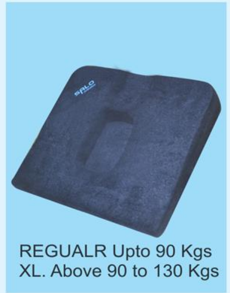
REGUALR Upto 90 Kgs XL. Above 90 to 130 Kgs