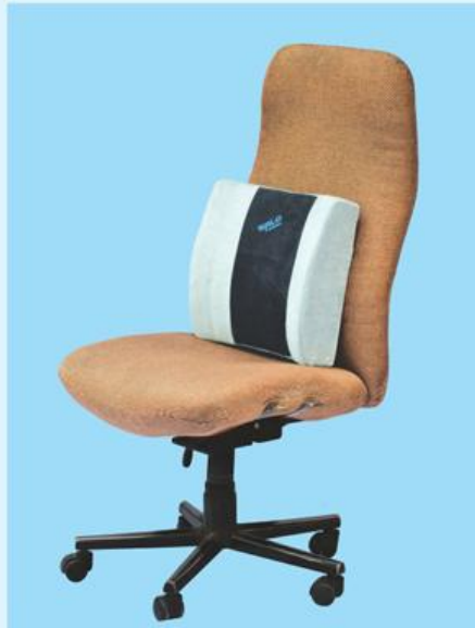
402 HEALTHY LUMBAR BACK SUPPORT