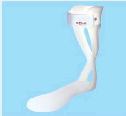
101 A AFO (BACK SIDE LONG BACK PADDING)