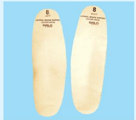
107 LATERAL WEDGE (OUTER ARCH)