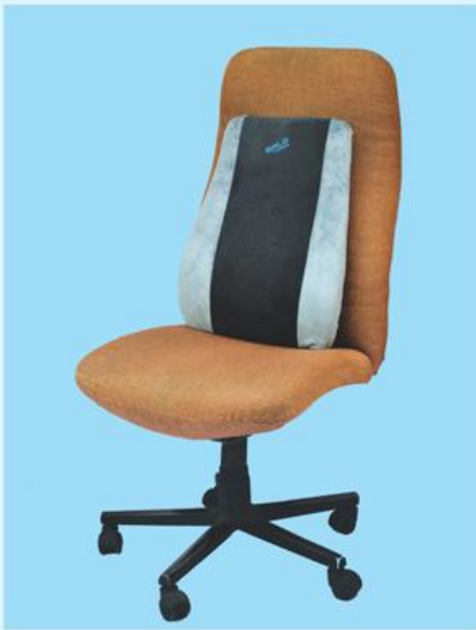
407 HI-EXECUTIVE BACK SUPPORT CUSHION