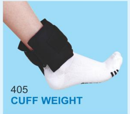
405 CUFF WEIGHT