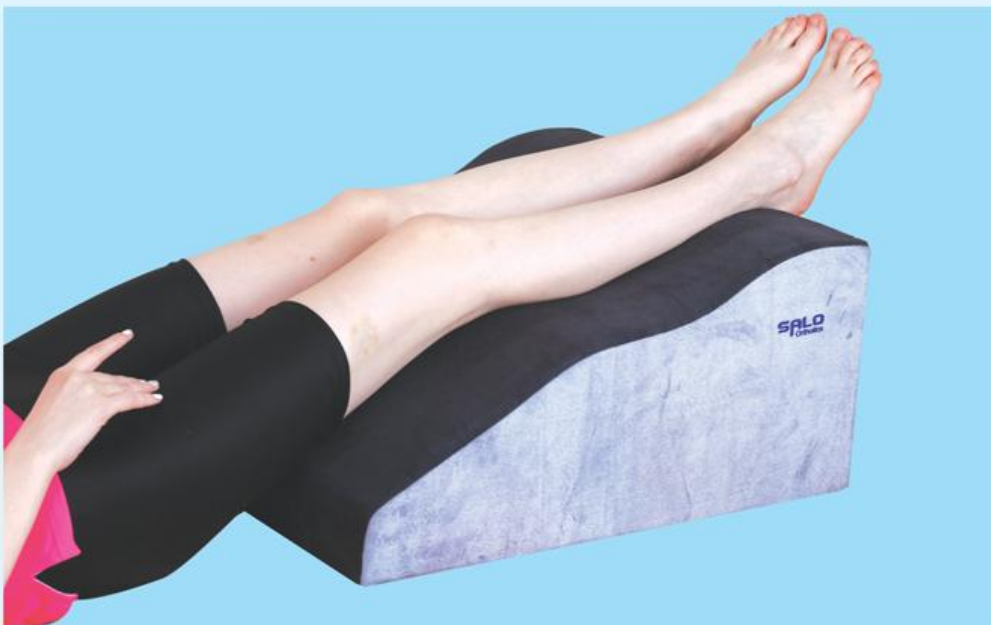
412 LEG ELEVATOR (ORTHO WEDGE SUPPORT)