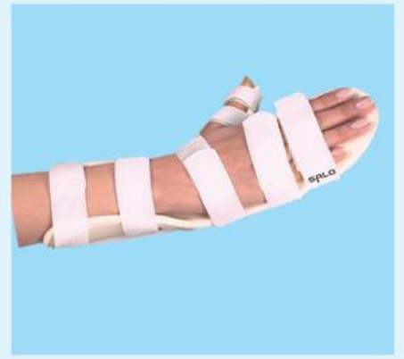
206 W.H.O. (FULL COCK-UP)