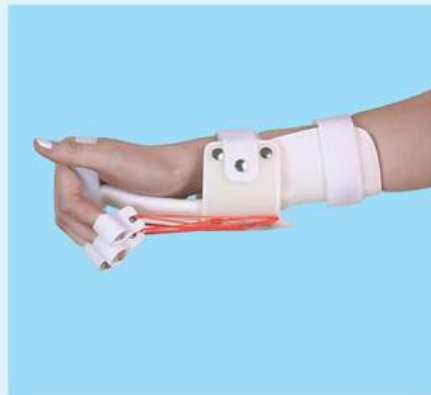
209 KNUCKLE BENDER