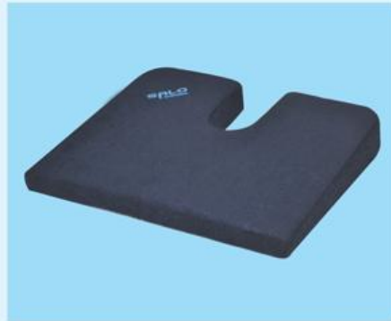
406 COCCYX CUSHION REGULAR Upto 85 Kgs 406 A COCCYX CUSHION XL Above 85 to 125 Kgs (For TAIL BONE PAIN)