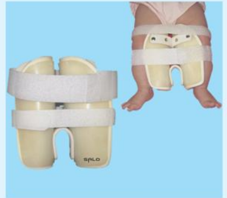
120 MERMAID SPLINT