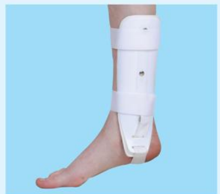
113 ANKLE BRACE