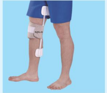
118 PUSH KNEE SPLINT