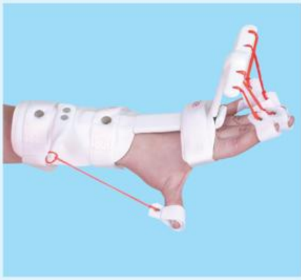
204 DYNAMIC EXTN.SPLINT