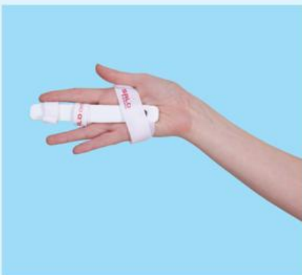
310 FINGER EXTENTION LONG SPLINT