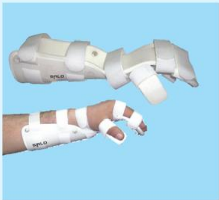
210 FUNCTIONAL HAND SPLINT