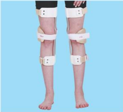
119 KNEE VARUM BRACE