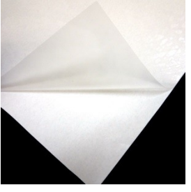
2) Take off paper backing

5) Heat transfer the image and Peel hot.