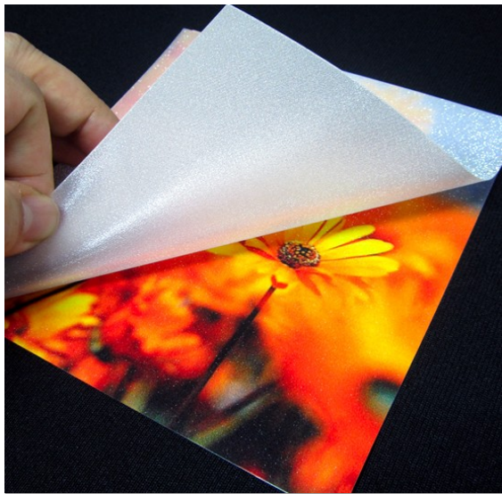
LAMINATED THE LUMIAN SPARKLE-AD ON THE PRINTED WHITE PVC FLEX