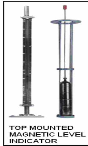
TOP MOUNTED MAGNETIC LEVEL INDICATOR