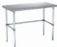
(SS) WORK TABLE