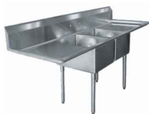
(SS) WASHING SINK