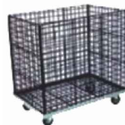
DRY LINEN TROLLEY