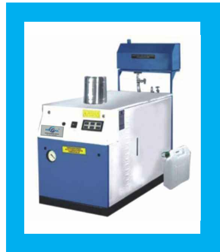
Capacity : 50 & 100 Kgs

These machines are equipped with several safety features like water level controller, pressure controller, Temperature controller, Pressure releasing valve, Safety Alarms, Safety Lockout features and visual indicators. The inner shell is constructed with strong seamless Pipes and fully tested for maximum Pressure holding capacity to ensure operator safety Fitted with Imported Eco flame Burners and control system.