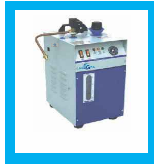
Capacity : 1 table

These machines are equipped with several safety features like water level controller, pressure controller, Temperature controller, Pressure releasing valve and visual indicators Fitted with Stainless Steel immersion heaters that can be easily replaced. These are very compact and easy to install and maintain.