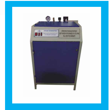
Capacity : 2 & 4 tables