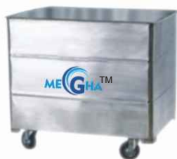
WET LINEN TROLLEY