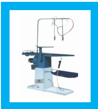
Table top padded with imported silicon foam and heat proof cloth. Provided exhaust duct with powerful suction through centrifugal blower activated by full length foot pedal. Provided imported steam / electrical iron with silicon pads, teflon shoes and arial spring.