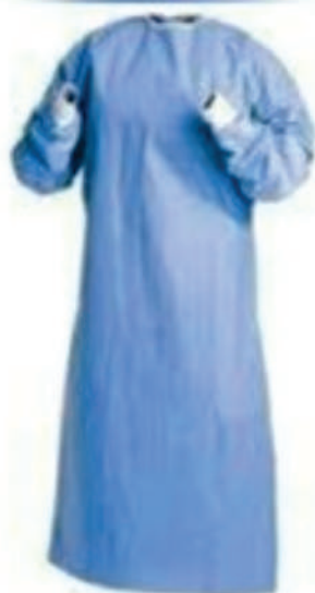
Disposable Non Woven Gown