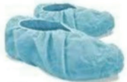
Disposable Shoe Cover