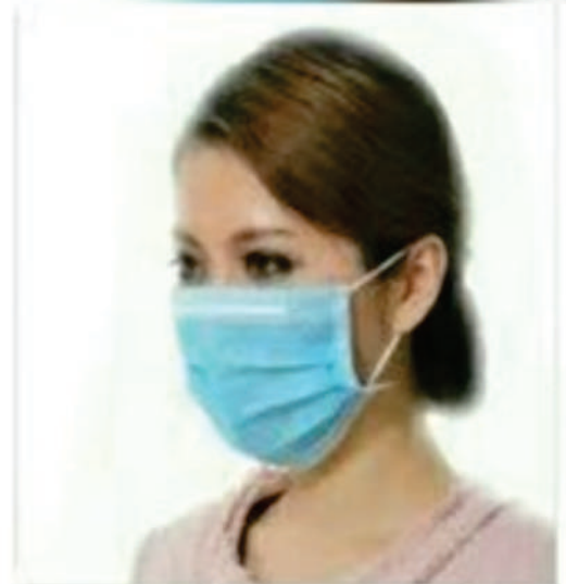
3 Ply Mouth Mask