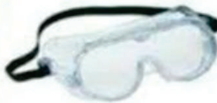
Disposable Eye Gear