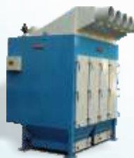
Cartridge Filter System