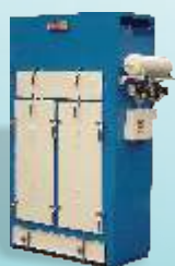
Micro Dust Collector