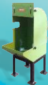
Custom-Made Suction Hood