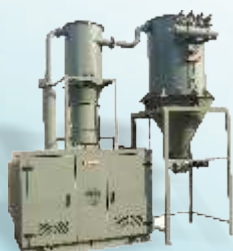
Central Vacuum System