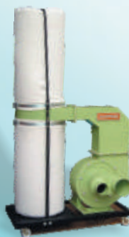
Wood Working Dust Collector