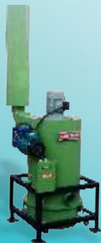
Stand-Alone Dust Collector