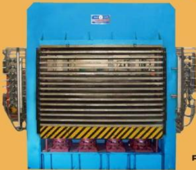
MULTI-DAYLIGHT HOT PRESS