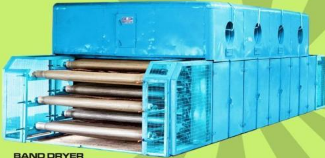
BAND DRYER (WITH STEEL BAND CONVEYER)