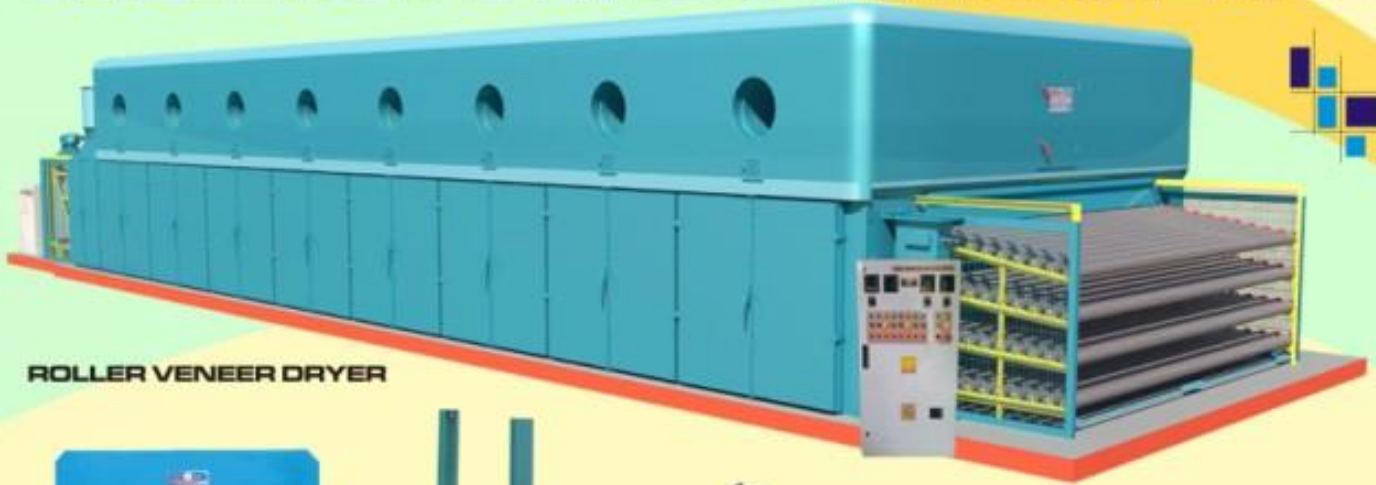
ROLLER VENEER DRYER