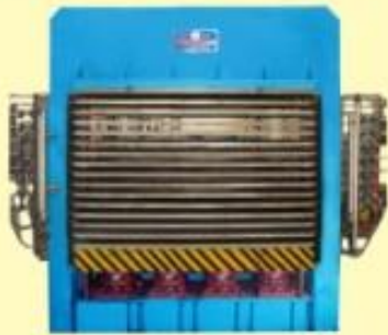
MULTI-DAYLIGHT HOT PRESS