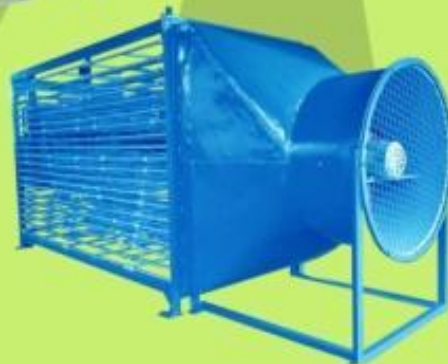
CAUL COOLING RACK