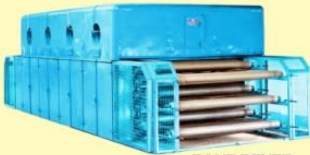
BAND DRYER (WITH STEEL BAND CONVEYER)