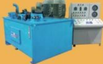
POWER PACK & PANEL