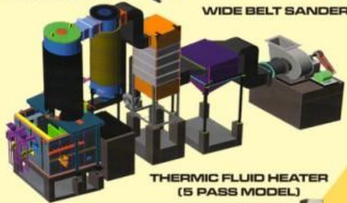
THERMIC FLUID HEATER (5 PASS MODEL)