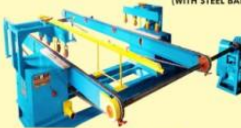
SEMI AUTO D.D. SAW