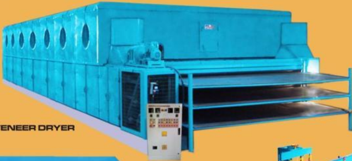
ROLLER VENEER DRYER