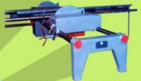
COMMERCIAL D.D. SAW