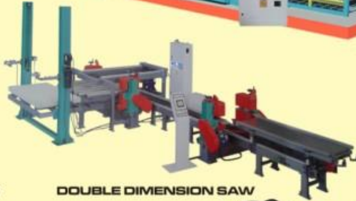
DOUBLE DIMENSION SAW