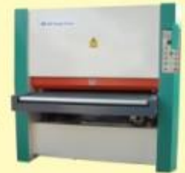
WIDE BELT SANDER