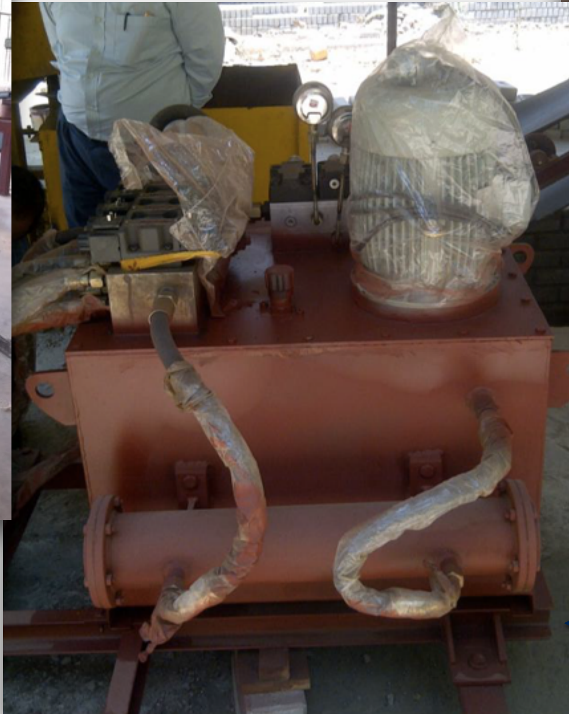
Power Pack Installed at TARA Machines