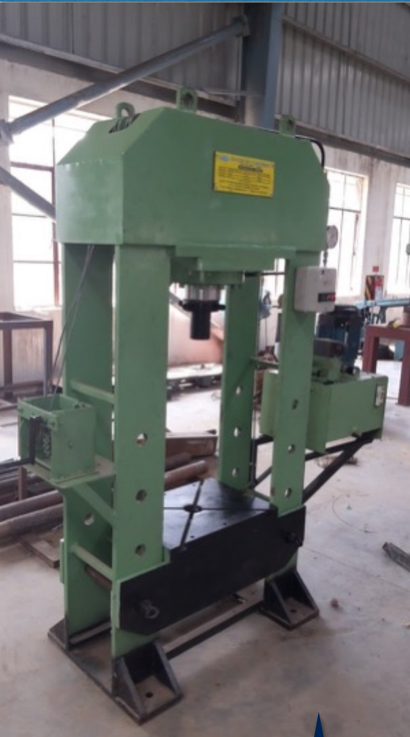
Hydraulic H-Frame Press at Alliance Tire Group