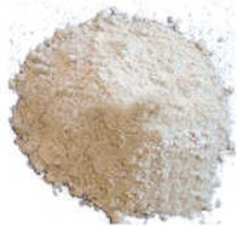
Edta Acid Powder