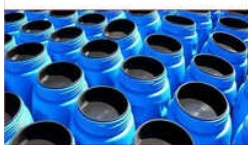
Rust Cleaning Chemical