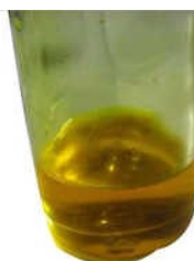
Industrial Chlorine Liquid