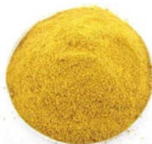
Poly Aluminium Chloride Powder