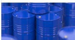
Anti Rust Chemical