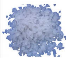
Sodium Hydroxide Flakes