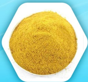
PAC Powder Form