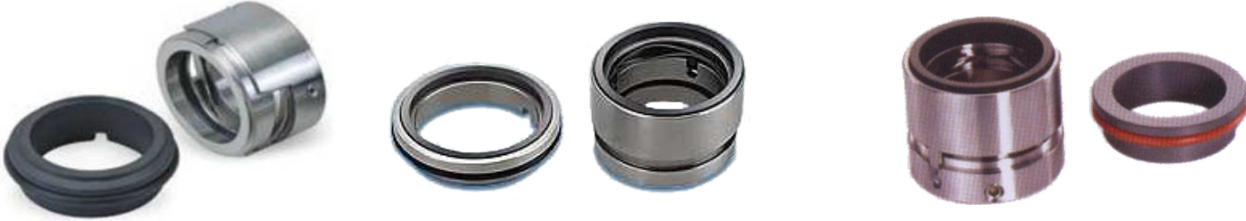
HTS/M70W-1 HTS/M70W-2 HTS/M70W-3