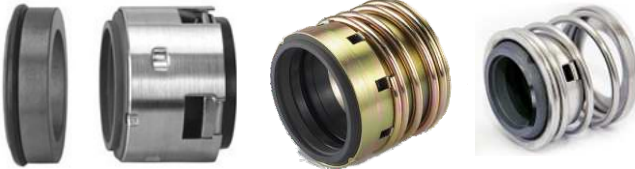
HTS/53U HTS/55C HTS/55S