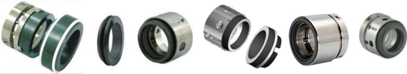
HTS/80A HTS/80B HTS/85U HTS/85M HTS/87U