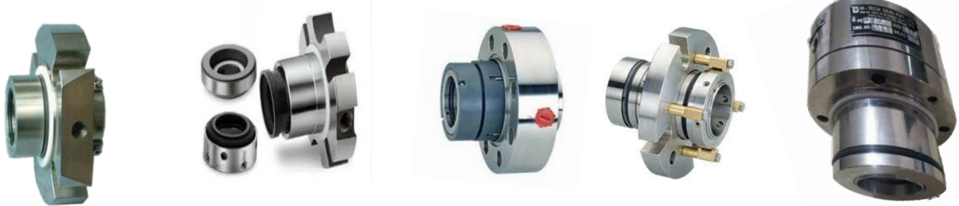
HTS/90B33 HTS/90B34 HTS/90B35 HTS/90B36 HTS/90B42