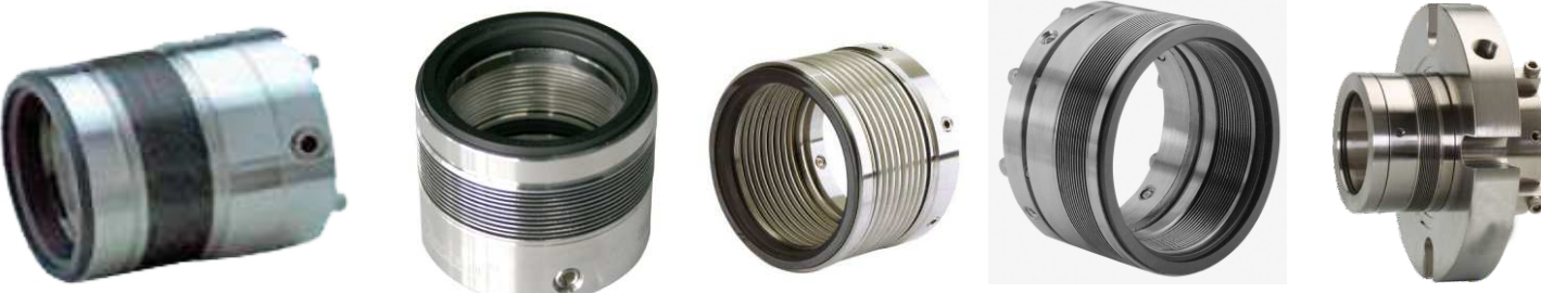
HTS/M65 HTS/M46 HTS/M44 HTS/M45 HTS/M45C