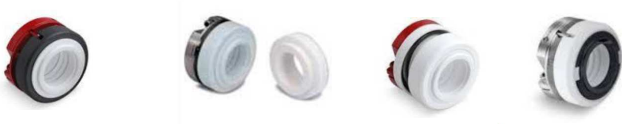
HTS/20C HTS/20M HTS/20S HTS/20R