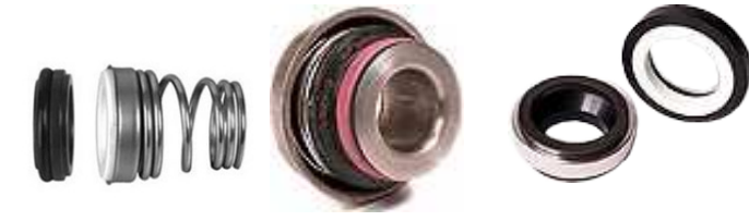
HTS/51U HTS/52U HTS/54U