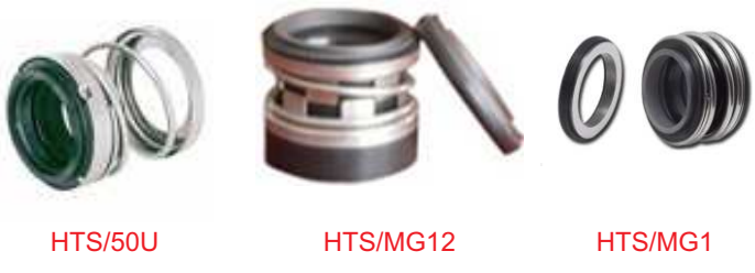
HTS/50U HTS/MG12 HTS/MG1