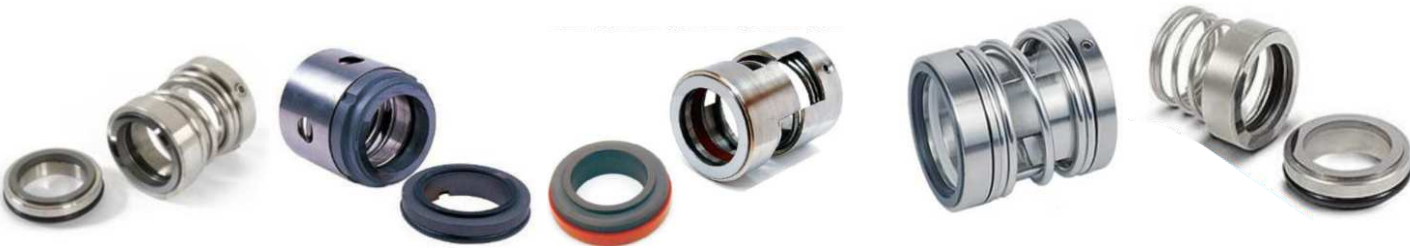
HTS/150 HTS/75U HTS/150S HTS/150S HTS/2U