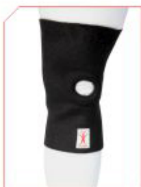
Neo Knee Cap Patella Single Product Code : KC05