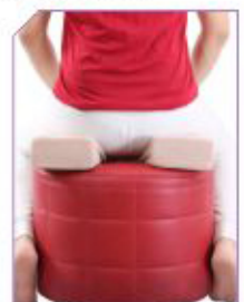
Coccyx Cushion (Square) Product Code : CX02