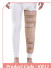
Product Code : KB12 Knee Brace Covered Patella 24" Spl.