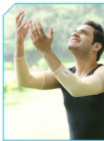
Elbow Support 7" Pair - Lycra Product Code : ES01