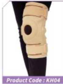
Product Code : KH04 Knee Support Patela hinged 10" DT