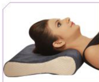
Pillow R Product Code : PL03