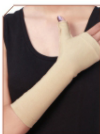
Gauntlet PG Single Product Code : GA01