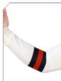
Tennis Elbow Support Elastic Product Code : TE02