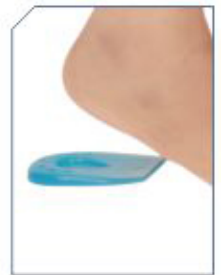
Calcaneal Spur - Silicone - Pair Product Code : SG06