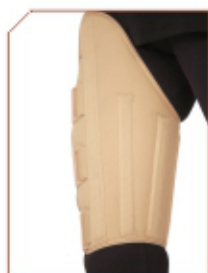
Thigh / Femur Brace Product Code : TH01