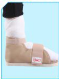
Cast Shoe Product Code : CS01