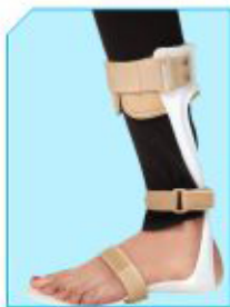
Foot Drop Splint - Left / Right Product Code : FD01

Rigid Polypropylene Sheet | Non Slip Grip | High Quality Aluminium Splint