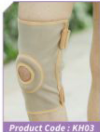
Product Code : KH03 Knee Support hinged Open Patela PG