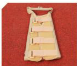
Leg Traction Brace Product Code : TR01

Non allergic. | Heavy-duty straps. | Heavy metal alloy rings. | Enhanced immobilisation & comfort.