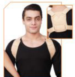
Clavicle Support E Pad Product Code : CB05