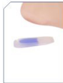
Heel Pad - Silicon Gel - Pair Product Code : SG05