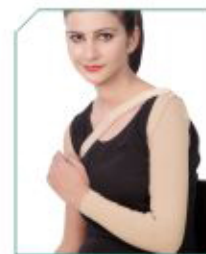
Product Code : VS08

Varicose Vein Stocking BELOW KNEE - Lycra - Single