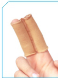
Joint Finger - PG Product Code : FS08