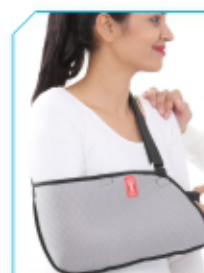
Pouch Arm Sling Netted Baggy Spl. Product Code : PA05