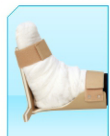
D Rotation Splint Univ. Product Code : DR01