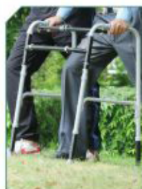
Walker Zig Zag Product Code : WK02