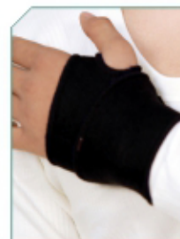
Neo Wrist Thumb Binder Product Code : WTB4