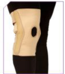
Product Code : KH01