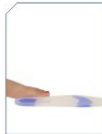
Elastomer Insole - Silicon Gel - Pair Product Code : SG02