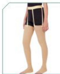
Product Code : VS04

Varicose Vein Stocking MID THIGH - PG - Single