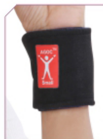
Neo Wrist Binder Product Code : WB02