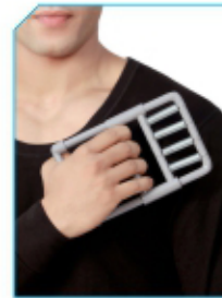
Finger Exerciser Product Code : FS09