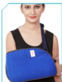
Pouch Arm Sling CC Baggy Spl. Product Code : PA03

Uniform Elbow Support. Simple Pull on Application.