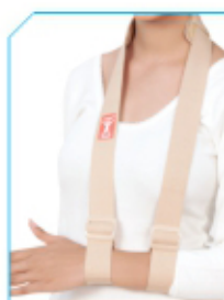
Arm Sling Strap Product Code : PA06