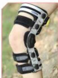
Knee Brace Silver K4 Product Code : KH13