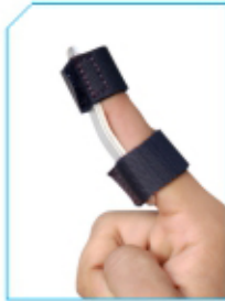
Finger Splint - Full Product Code : FS02