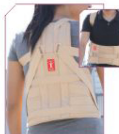
Taylor Brace Spl. Product Code : TB02

Adjustable shoulder straps Improved durability, maintains the spine in neutral position.