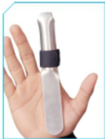
Finger Cot Extension Splint Product Code : FS06