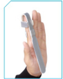
Finger Extension Splint Product Code : FS05