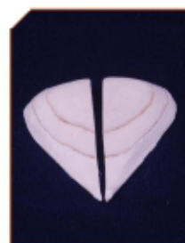
Arch Support - Eva Product Code : AR01