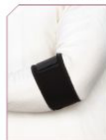
Neo Tennis Elbow Product Code : TE03