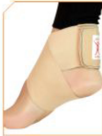
Ankle Binder Plain Elastic 3" Product Code : AN01