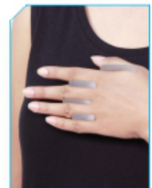
Finger Separator - Gel - 4 Pcs Product Code : SG08