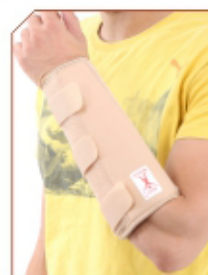
Forearm Brace Product Code : FA01