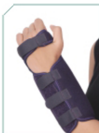
Wrist Cock Up 9" Universal Product Code : WCP1

Ergonomic Design. Adjustable Velcro Straps.