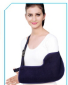
Pouch Arm Sling CC R Product Code : PA01