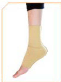
Anklet PG - Single Product Code : AN06