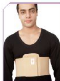
Rib Belt 6" with Pad Product Code : RB02