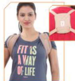
Clavicle Brace RC Square Pad Product Code : CB04