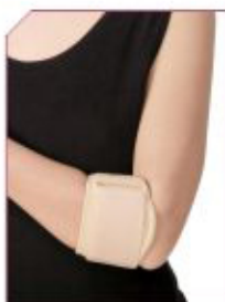
Tennis Elbow Support Product Code : TE01

Non Allergic Full & Easy Elbow Movement.