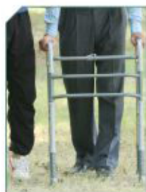
Walker R Product Code : WK01

Anti skid. | PVC handle. | Elegant looks. | Zero rust product. | International quality product.