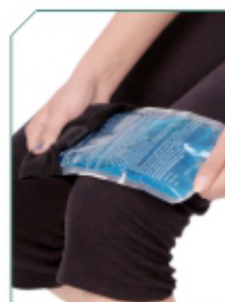
Product Code : HCG1 Size : Medium(260mm x 125mm)

Reusable. Can be heated in microwave or boiling water. Can freeze in regular freezer. Washable cloth cover maintains the temperature for longer duration.