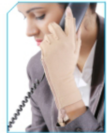
Gloves Single PG Product Code : FS10