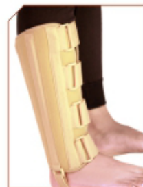
Tibia Brace Product Code : TI01