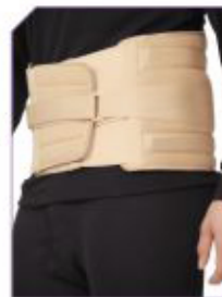
Frame Back Support Dlx. Spl. Product Code : FB03

Pleasing Aesthetics. Comfortable Padding for Frame & Straps.