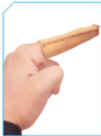
Finger - PG Product Code : FS07