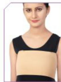
Rib Belt 6" Female Product Code : RB03