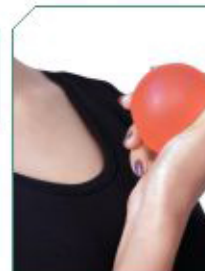
Product Code : SG12 Sizes : Medium