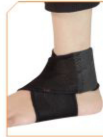
Neo Ankle Binder 3" Product Code : AN03