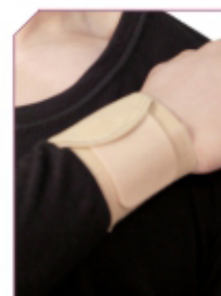
Wrist Binder 3" Plain D/Lock Product Code : WB03