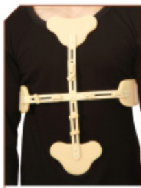
Ash (Hyper Xtn.) Brace Product Code : AH01