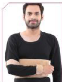
Shoulder Immobilizer 6" Product Code : SI03