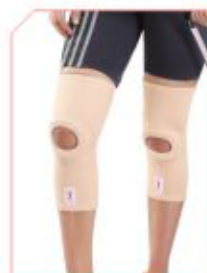
Knee Cap Patella - Gel - Single Product Code : KC09