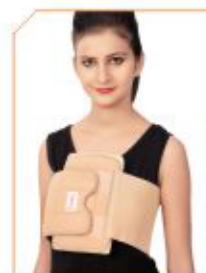
Chest Binder 9" Pad Product Code : CH02