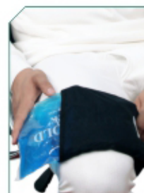
Product Code : HCG2 Size : Large(300mm x 180mm)