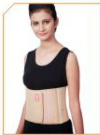
Abdominal Support 8" 2 O/L Product Code : AS03