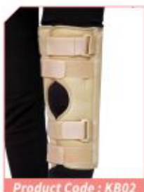
Product Code : KB02 Knee Brace Open Patella 12" Spl.