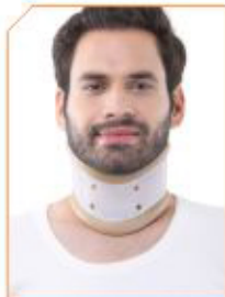
Cervical Collar Hard Product Code : CC04