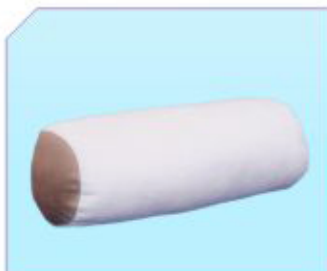
Pillow Round Dlx. Product Code : PL01