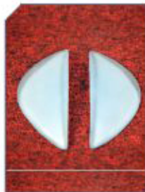
Medial Arch - Gel - Pair Product Code : SG11

Long life. High grade silicon. Easy maintenance.