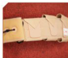
Skin Traction Brace Product Code : TR03