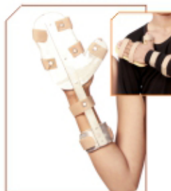
Static Cock-up - Left / Right Product Code : SC01