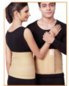
Abdominal Belt PG Product Code : AS08