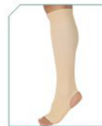
Product Code : VS05

Varicose Vein Stocking FULL LENGTH - PG - Single