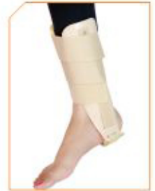
Ankle Splint Product Code : AN04