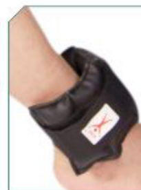
Product Code : WC01 Weight : 1 kg

Each cuff works for either ankle or wrist.