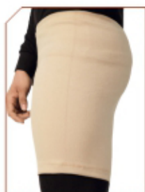
Hip Spica PG Single Product Code : HS01