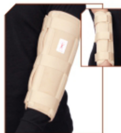
Arm Immobilizer Product Code : AI01