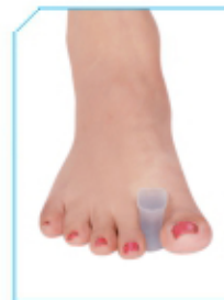
Toe Spreader - Gel - Pair Product Code : SG07