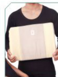
Back Rest Dlx. H Product Code : BR01

Hook & loop closure for easy installation.