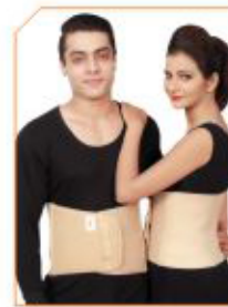
Abdominal Support 9" Spl. Product Code : AS05