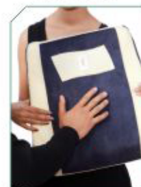
Back Rest Dlx. V Product Code : BR02