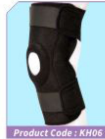
Product Code : KH06 Neo Knee Support hinged 12"