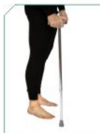
Walking Stick - Adjustable Product Code : WS01