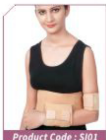
Product Code : SI01 Elastic Shoulder Immobilizer Bicep Support

Ergonomic Design. Adjustable Velcro Straps. Enhanced Immobilisation & Comfort.