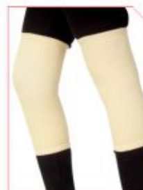
Knee Support R Pair Product Code : KC01