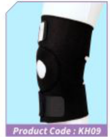
Product Code : KH09 Neo Knee Support Open Patela 3 Straps