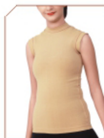
Jacket PG Product Code : JK01