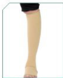
Product Code : VS01

Opaque aesthetics | Non allergic fabric | Enhanced immobilisation & compression.