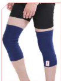
Knee Support PC Spl. Pair Product Code : KC02