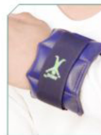
Product Code : WC50 Weight : 0.5 kg