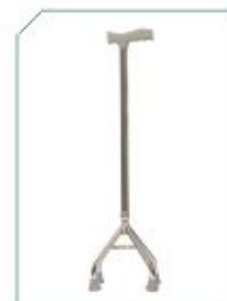
Walking Stick - Quadripod Product Code : WS03