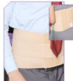
Lumbo Sacral Belt-D/P Product Code : LS08