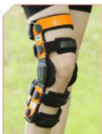
Knee Brace Orange K2-S05 Product Code : KH11

Comfortable Padding for Frame & Straps. | Constructed from Light High Grade Aluminium.