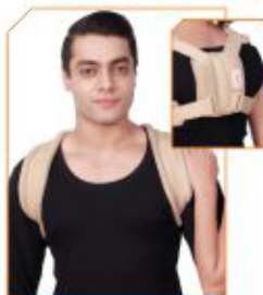
Clavicle Brace VC Product Code : CB02

Adjustable shoulder straps Corrects the shoulder posture & Ensure better fitting with full arm movement.