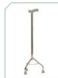
Walking Stick - Tripod Product Code : WS02