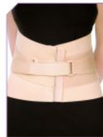
Frame Back Support Elastic Spl. Product Code : FB01