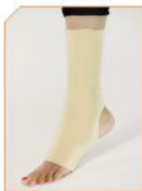
Anklet 12" Pair Spl. Product Code : AN09