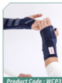
Product Code : WCP3