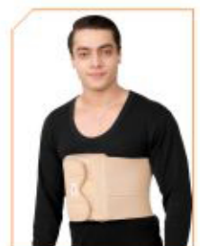
Chest Binder 8" Pad Spl. Product Code : CH03