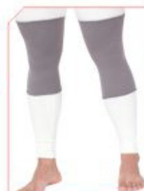
Knee Support PC Spl. Grey Pair Product Code : KC12

Sweat Absorption Technology. High Quality Breathable Elastic.