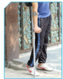
Elbow Stick Product Code : EL01