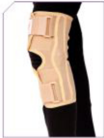
Knee Support hinged PG Product Code : KH02