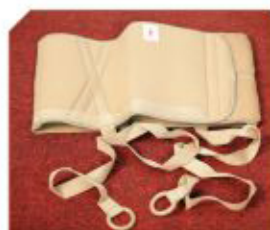
Pelvik Traction Belt Product Code : TR02