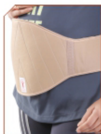
Maternity Belt Product Code : MB01

Opaque aesthetics | Non allergic fabric | Enhanced immobilisation & compression.