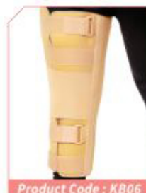
Product Code : KB06 Knee Brace Covered Patella 20" Spl.