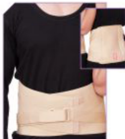
L S Belt - Contour - Plain Product Code : LS02