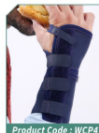
Product Code : WCP4