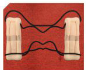
Cervical Head Halter Product Code : TR04