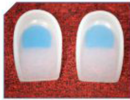
Heel Cup Cushion - Silicon Gel - Pair Product Code : SG10