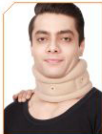
Cervical Collar Spl. Product Code : CC02