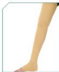
Product Code : VS03

Varicose Vein Stocking BELOW KNEE - PG - Single