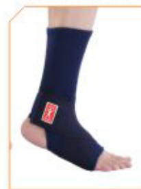
Anklet with Ankle Binder Lycra Product Code : AN11