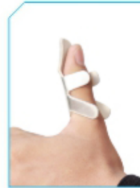
Frog Splint Product Code : FS04