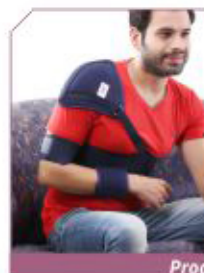
Product Code : SI02 Elastic Shoulder Immobilizer Addl. Support