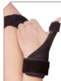
Neo Thumb Spica Product Code : TS02