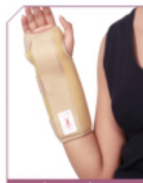
Product Code : WF01

Highly Customisable. Enhanced Immobilisation & Comfort.