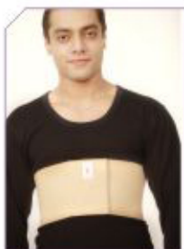
Rib Belt 6" R Product Code : RB01

Sweat Absorption Technology. High Quality Breathable Elastic.