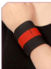
Wrist Binder 3" Product Code : WB01

Pleasing Aesthetics Sweat Absorption Technology.