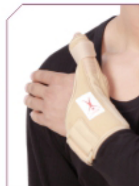
Thumb Spica Splint Univ. Product Code : TS01

Non Allergic. Highly Durable Perforated Foam.