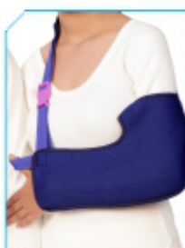
Pouch Arm Sling Netted R Product Code : PA04