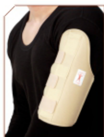
Humerus Brace Product Code : HB01