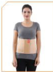
Abdominal Support 9" Product Code : AS04