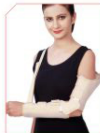
Elbow R.O.M. Brace Product Code : RE01