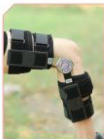
Knee ROM Brace Product Code : KH14

Enhanced Immobilisation & Comfort at any Angle.