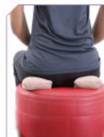
Coccyx Cushion (Round) Product Code : CX01