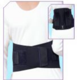
L S Belt - Contour - D/P Product Code : LS01

Malleable Molded Aluminium Stays for Perfect Contour Fit.