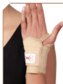
Carpal Tunnel Splint Product Code : CT01