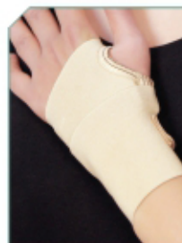
Wrist Thumb Binder 3" Plain Product Code : WTB1

Non Allergic. High Quality Breathable Elastic.