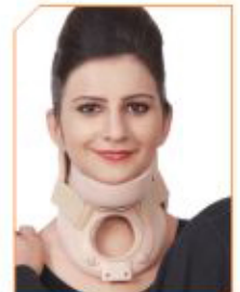
Philadelphia Collar Product Code : Cc07