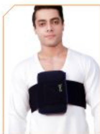
Chest Binder 8" Pad Product Code : CH01