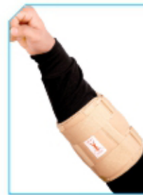
Elbow Immobilizer Support Product Code : ES05