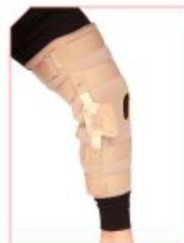
Knee R.O.M. Open Patella 18" Product Code : RO01