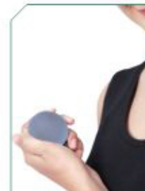
Product Code : SG13 Sizes : Large