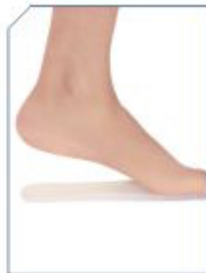
Elastomer Insole - Silicon - Pair Product Code : SG01