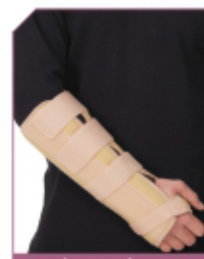
Product Code : WF03