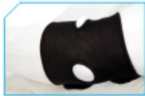
Neo Elbow Support 6" Single Product Code : ES04