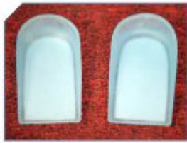
Heel Cup Cushion - Gel - Pair Product Code : SG09

Long life. | Elegant looks. | High grade silicon. | Easy maintenance.