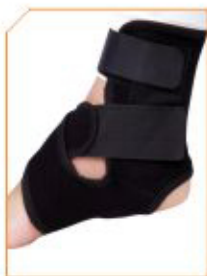
Neo Ankle Splint Product Code : AN05