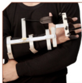
Dynamic Cock Up Univ. Product Code : DC01