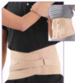
L S Belt - Contour - I/Let Product Code : LS04