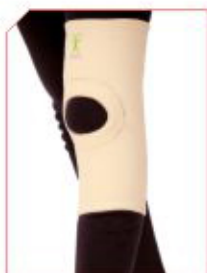
Knee Support Patella R Pair Product Code : KC06