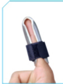
Finger Cot Product Code : FS03