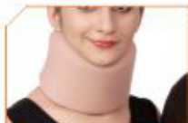
Cervical Collar Soft Product Code : CC01