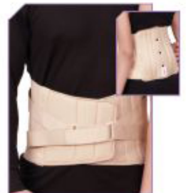
L S Belt - Corset - Netted Product Code : LS10