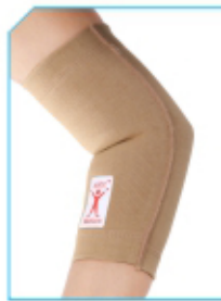
Elbow Support 8" Single - PG Product Code : ES02