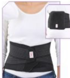
Neo L S Belt - Contour Product Code : LS06