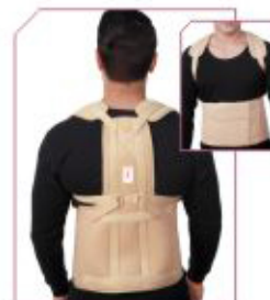
Taylor Brace Univ. Product Code : TB03