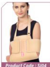
Product Code : SI04 Shoulder Immobilizer Support CC