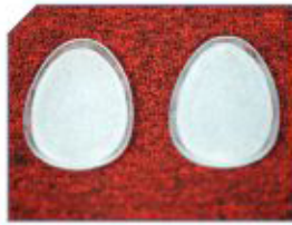
Heel Cushion - Female - Gel - Pair Product Code : SG14