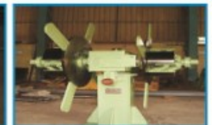
Twin Arm Uncoiler