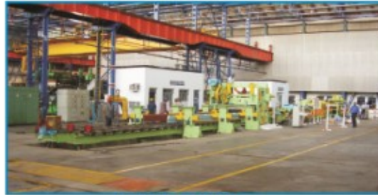
Cut to Length Line

The production unit of the company is located at Dewas by the side of national Highway. It spreads across an area of over 35000 sq.ft. and equipped with a modern machine shop consisting of machines, inspection area and assembly shop with heavy duty crane, precise measuring devices, enclosed space and ideal infrastructure for Trial Run of Coil Processing Lines. The factory also includes administrative and works office for the management and staff with high speed Internet connectivity. Excellent transport facilities, abundant raw material sources and ready availability of low cost skilled manpower are some of the geographical advantages enjoyed by the company. The production facility has an in-house Design Center with latest software.