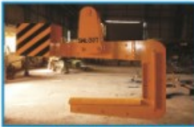
Coil Lifting C-Hook