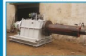
Single Mandral Uncoiler