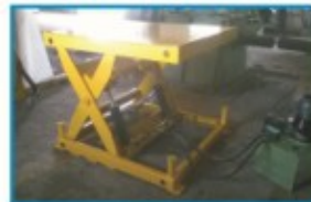
Scissor Lift Platform