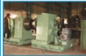
Cone Type Uncoiler