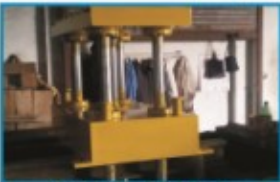
Hydraulic lift Table