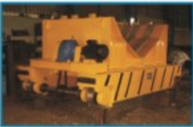
Coil Transfer Trolley