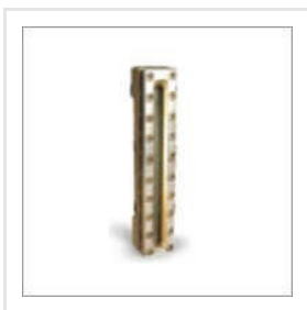
Liquid Level Glass