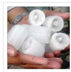
Ice Manufacturing Plant