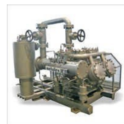
COMPRESSOR PACKAGE UNIT