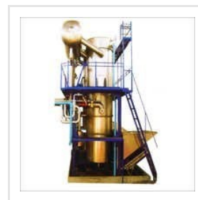
Tube Ice Machine