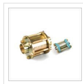
NRV Check Valves