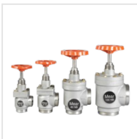
Flange Type Angle Valve