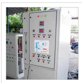
Ice Plant Machine