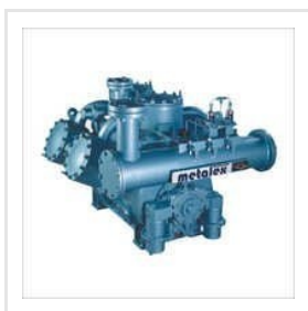
Ammonia Compressor Parts