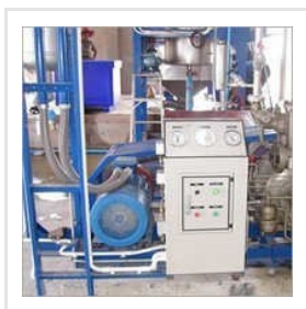
Industrial Ice Tube Making