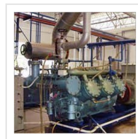
Tube Ice Plant