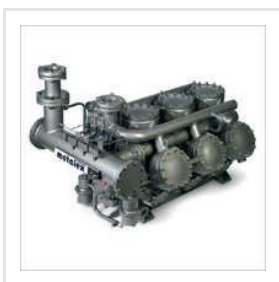
Single Stage Reciprocating