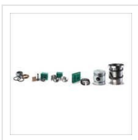
Compressor Genuine Parts