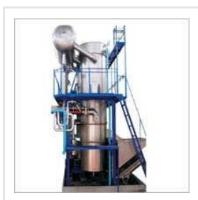
Tube Ice Machine