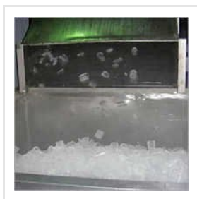
Industrial Tube Ice Machine