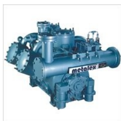
AMMONIA AIR COOLED COMPRESSOR

Ammonia Air Cooled Compressor, Ammonia Compressor Parts, Ammonia Open Type Pump Series GP, Ammonia Pump Hermetic Series HRP, Ammonia Single Cylinder Compressor, Ammonia System High Side Float Regulators, Ammonia Water Cooled Compressors, Automatic Ice Block Maker Machine, Block Ice Machine, Block Ice Plant, Block Ice Plant Machine, Compressor Genuine Parts, Compressor Package Unit, Flange Type Angle Valve, Flanged Globe Valves, etc.