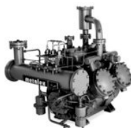
AMMONIA WATER COOLED COMPRESSORS