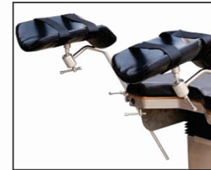
Knee Crutches (1 Pair)