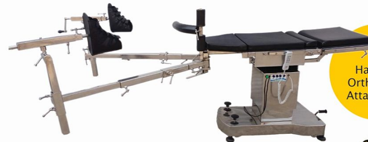
Hanging Orthopedic Attachment