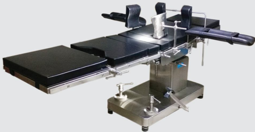
Hydraulic O.T. Table Code : ACME 1202