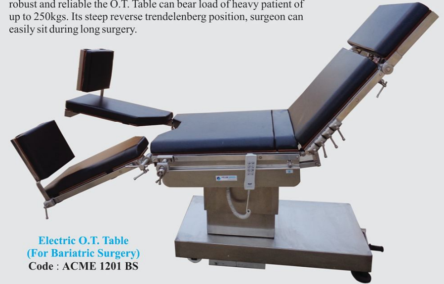
Electric O.T. Table (For Bariatric Surgery) Code : ACME 1201 BS

ACME 1201BS is specially designed for bariatric surgery. Being robust and reliable the O.T. Table can bear load of heavy patient of up to 250kgs. Its steep reverse trendelenberg position, surgeon can easily sit during long surgery.