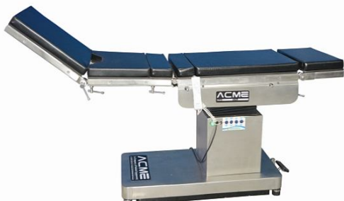
Head Section up