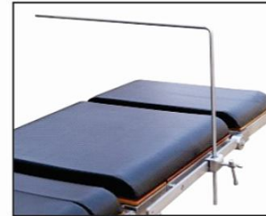
Anaesthetic Frame (1 Pcs)