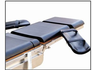
Intravenous Armboard (1 Pair)