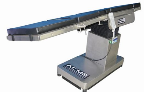
Lateral Tilt Right