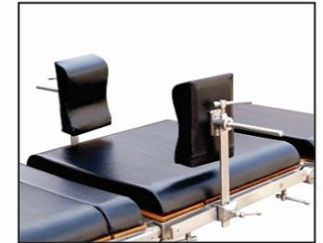
Padded Side Supports (1 Pair)