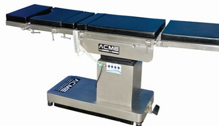
Head & Leg Section Interchangeable