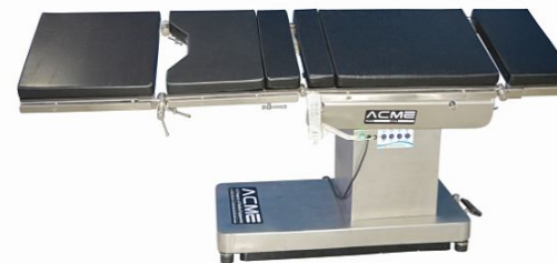
Lateral Tilt Left