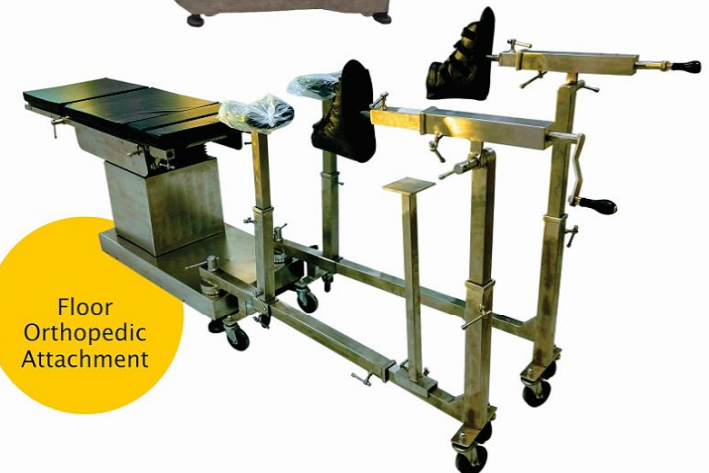
Floor Orthopedic Attachment