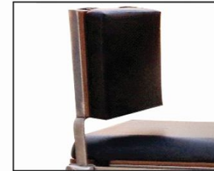
Feet Support (1 Pair)