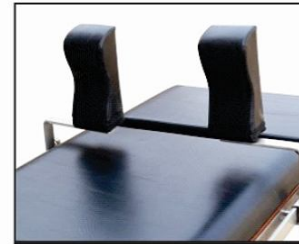
Padded Shoulder Supports (1 Pair)