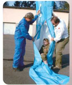
FIRE ESCAPE CHUTE FOR INCLINED DESCENT