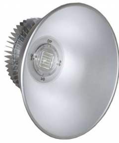
Figure – 1