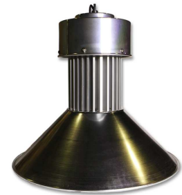
Figure – 3