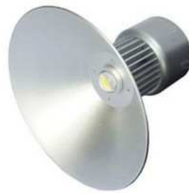
Figure – 2