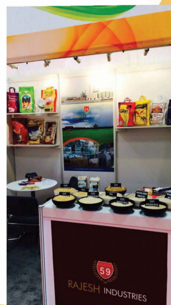
Fancy Food Show