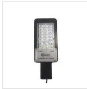
Osram LED Street Light