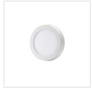
LED Surface Panel Light