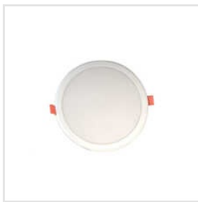
PC Plastic LED Panel Light