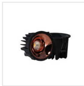
Amor Deep COB Light