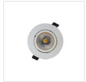
Movable COB Light