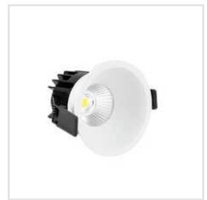
Indoor Deep COB Light