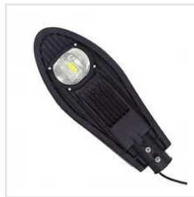
Outdoor LED Street Light