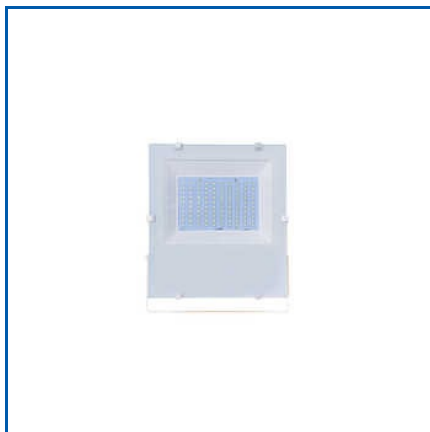
ECO LED FLOOD LIGHT