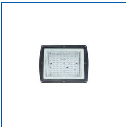
LED BACK CHOKE FLOOD LIGHT

100 W LED Flood Light, 24 V LED Slim Metal SMPS, Amor Deep COB Light, Cylinder COB Light, ECO LED Flood Light, GM Model LED Flood Light, High Bright Ultra Slim LED Recessed Panel Light, Indoor Deep COB Light, LED Back Choke Flood Light, LED Deep Panel Light, LED GB Panel Light, LED Glass Street Light, LED Lens Model Street Light, LED Round Panel Light, LED Slim Panel Light, etc.