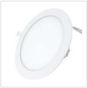
High Bright Ultra Slim LED Recessed Panel