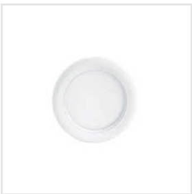
LED Round Panel Light