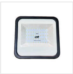
GM Model LED Flood Light