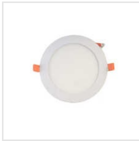
LED Slim Panel Light