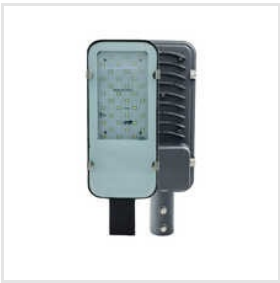
LED Glass Street Light