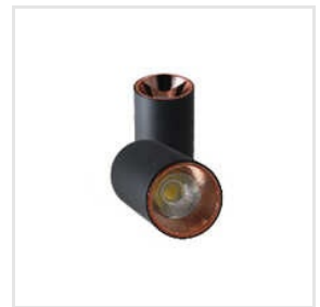
Cylinder COB Light