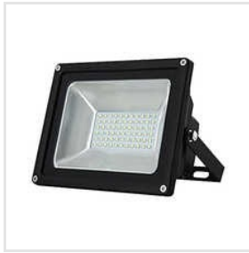
LED Square Flood Light