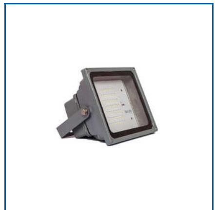
100 W LED FLOOD LIGHT