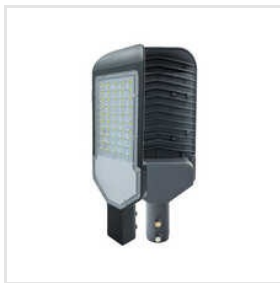
LED Lens Model Street Light