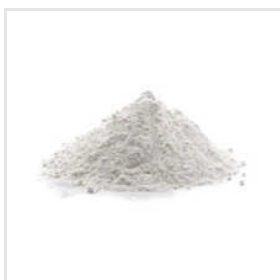
Titanium Dioxide Powder