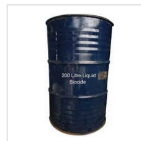
200 Litre Liquid Biocides