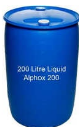
200 LITRE IGL ALPHOX CHEMICAL