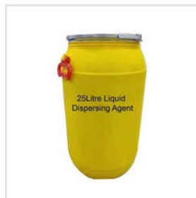
250 KGS Liquid Dispersing Agents