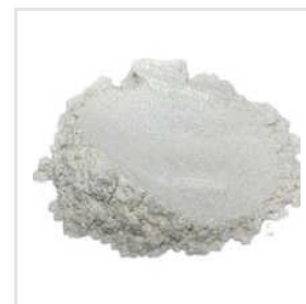
Silver White Pearl Pigment