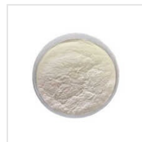
Methyl Hydroxyethyl Cellulose Powder