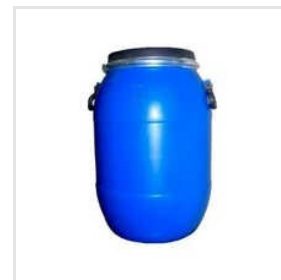
Liquid Dispersing Agents