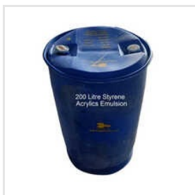
220 KGS Styrene Acrylic Emulsion