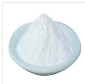
White RD Powder