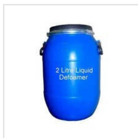
16 KGS Liquid Defoamer