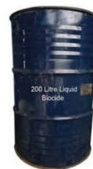
200 LITRE LIQUID BIOCIDES