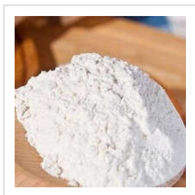
White Sodium Carboxymethyl