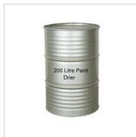
200 Litre Paint Drier