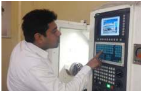
Emtex Service Engineers While Working on Machine