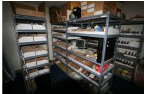
Spare Parts of Machines