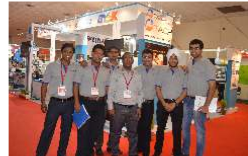
Tach Service Team