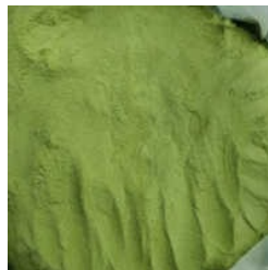
CHELATED MIX MICRONUTRIENT - COMBI MIXTURE