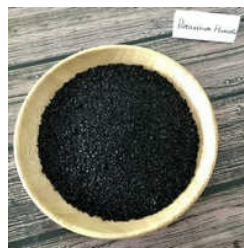
Super Potassium Humate