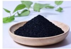
Seaweed Extract Flakes