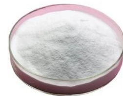
CHELATED ZINC AS ZN EDTA