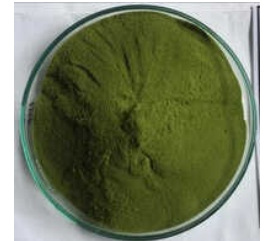
Mix Micronutrients Mixture Edta Chelated