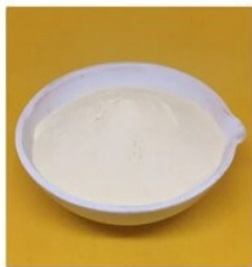
CALCIUM BORON MAGNESIUM CHELATE

Atonik Sodium Nitrophenolate 98%, Boron 20% Di Sodium Octaborate Tetrahydrate, Calcium Boron Magnesium Chelate, Chelated Zinc as Zn EDTA, Chelated mix micronutrient - Combi Mixture, Copper Sulphate Powder, DA6 Diethyl Amino ethyl Hexanoate, Fulvic Acid, Green Seaweed Extract Powder, Humic Acid, Hydrogel Polymers, IBTA Plant Growth Promoter, Indole - 3 Butyric Acid IBA, Kelp Green Seaweed Water Soluble Powder, Manganese Sulphate, etc.