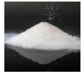
Silicon Powder For Foliar Spray