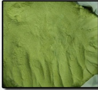
MIX MICRONUTRIENTS COMBI MIXTURE