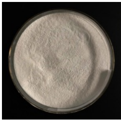
DA6 Diethyl Amino Ethyl Hexanoate