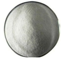
IBTA Plant Growth Promoter