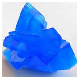
Copper Sulphate Powder