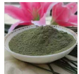
Kelp Green Seaweed Water Soluble Powder