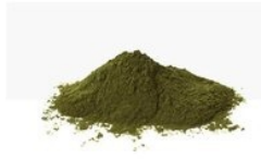
Green Seaweed Extract Powder