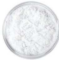
Boron 20% Di Sodium Octaborate