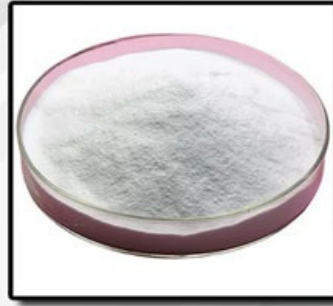
CHELATED ZINC MICRONUTRIENT