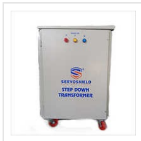
Step Down Transformers