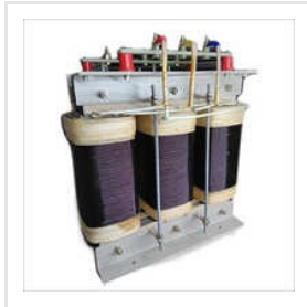
Three Phase Isolation Transformer