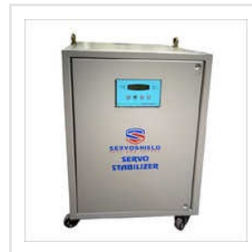
Three Phase Air Cooled Servo Stabilizer