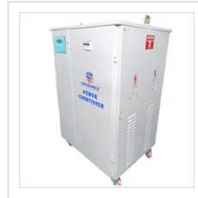
Servo Stabilizer With Isolation Power