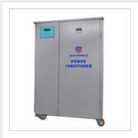
Power Conditioner Servo Stabilizer With