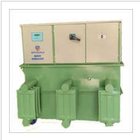
Three Phase Oil Cooled Micro Controller Based