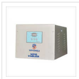
Single Phase Servo Stabilizer With Surge