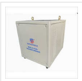
Industrial Isolation Transformer