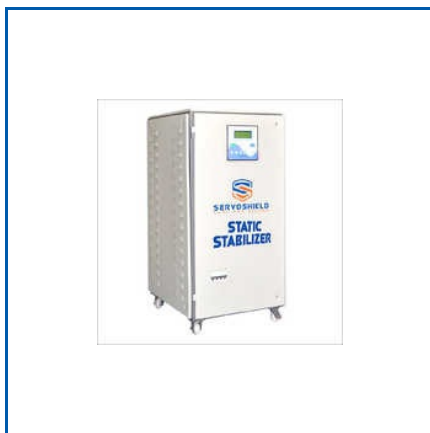
STATIC VOLTAGE STABILIZER