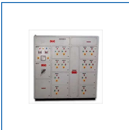
APFC CONTROL PANEL

AC Voltage Stabilizer, APFC Control Panel, Industrial Isolation Transformer, Isolation Transformer, Power Conditioner Servo Stabilizer with Isolation & Stepdown Transformer, Residential Modern Stabilizer, Servo Stabilizer with Isolation Power Conditioner, Single Phase Servo Stabilizer, Single Phase Servo Stabilizer With Surge Protection, Static Voltage Stabilizer, Step Down Transformers, Three Phase Air Cooled Micro Controller Based Servo Stabilizer, Three Phase Air Cooled Servo Stabilizer, Three Phase Isolation Transformer, Three Phase Oil Cooled Micro Controller Based Servo Stabilizer, etc.