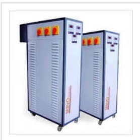
Residential Modern Stabilizer