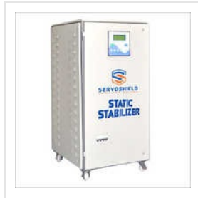
Static Voltage Stabilizer