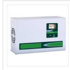
AC Voltage Stabilizer