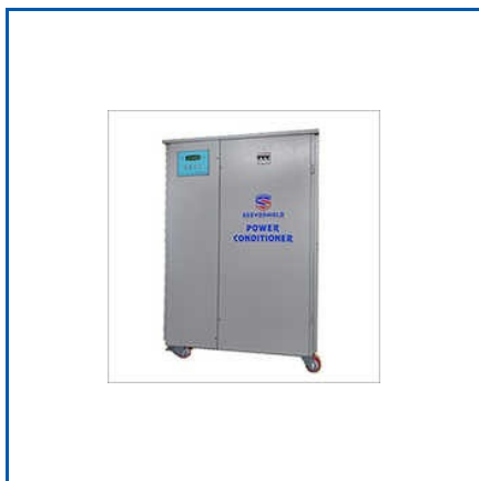
POWER CONDITIONER SERVO STABILIZER WITH ISOLATION & STEPDOWN TRANSFORMER