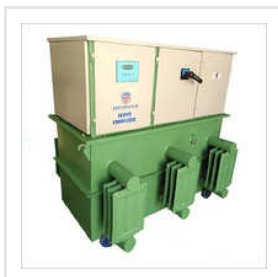
Three Phase Oil Cooled Servo Stabilizer