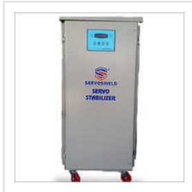
Three Phase Air Cooled Micro Controller Based