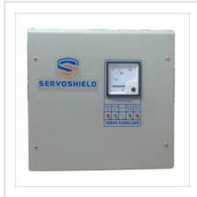
Single Phase Servo Stabilizer