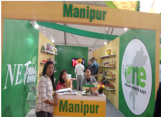
Participation in World Food India 2017

Meira Foods has also participated in India's largest International event in food processing and allied sectors "World Food India 2017" at New Delhi from 3 rd to 5 th November 2017. It was organized by the Ministry of Food Processing Industries (MOFPI), Government of India to showcase the immense opportunities offered by Indian food processing sector.