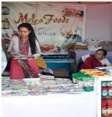
Our employee with our products in Sangai Festival, November 2017

Every year, Meira Foods participates in Sangai Festival, which is an annual cultural festival organized by Manipur Tourism Department every year from 21 st Nov to 30 th Nov. The main objective of this festival is to promote Manipur as a world class tourism destination. It showcases the best of what the state has to offer to the world in terms of art and culture, handloom, handicrafts & fine arts, indigenous sports, cuisines & music, eco & adventure sports as well as the scenic natural beauty of the land.