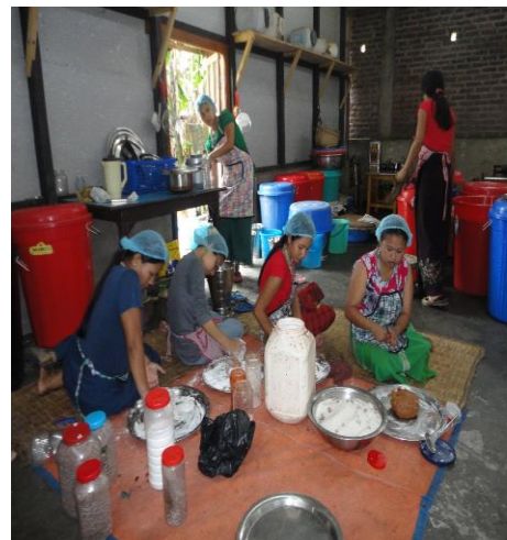
Meira workers making candies