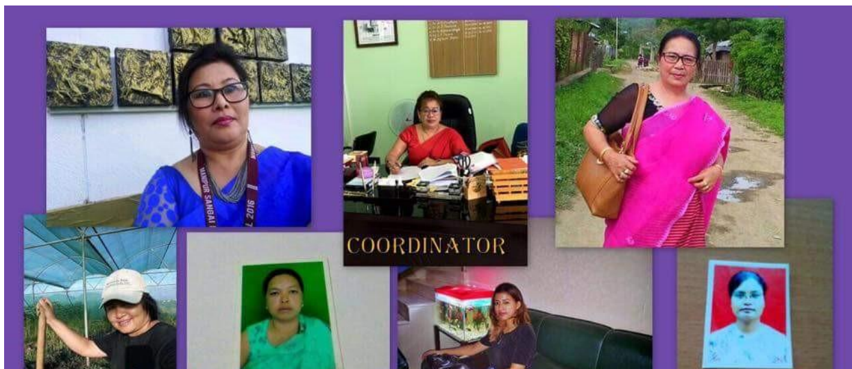
Some of the members of Pioneer Manipur Women Entrepreneur's Association