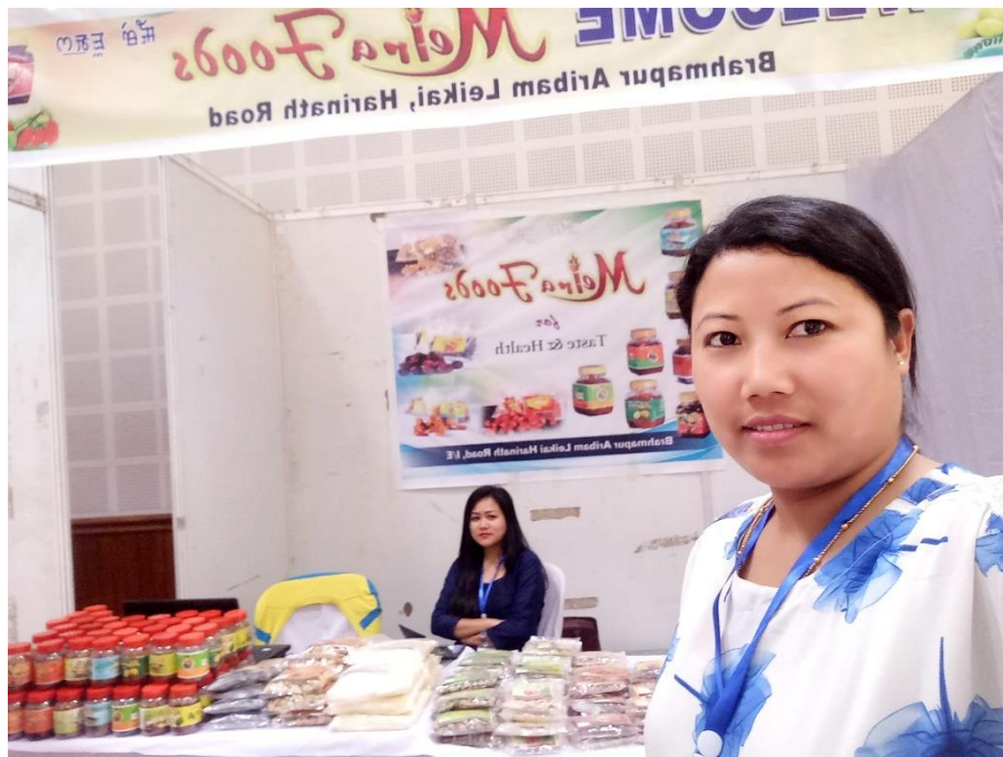
Our Meira Foods's employees with our products in Buyer-seller meet