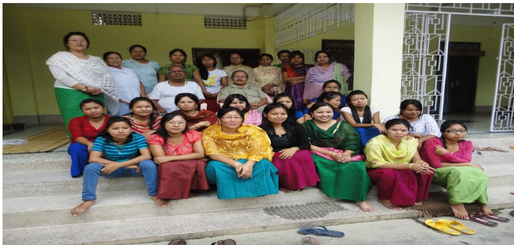
Get together party of Meira team