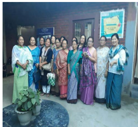
Members of Pioneer Manipur Women Entrepreneur's Association