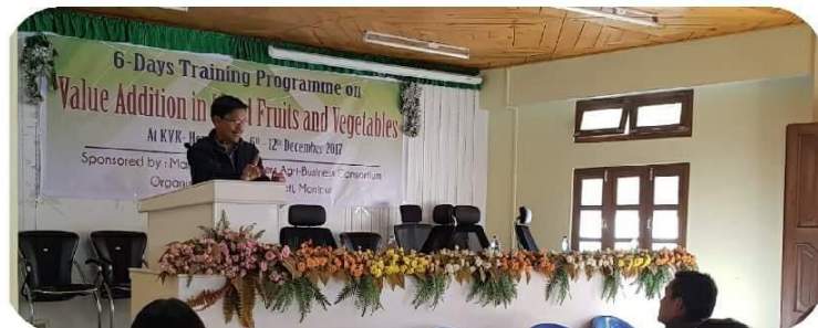
6-Days training programme on Value Addition in Local fruits and Vegetables organized by KVK- Senapati, Manipur (6 th -12 th December 2017)