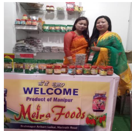
Meira Foods's employees participating in IITF Delhi 2017

India International Trade Fair which was held on 14-27 Nov 2017 at Pragati Maidan, New Delhi is a multi-product exhibition and the largest and biggest integrated trade fair with B2B and B2C components. Meira Foods is a regular participant of IITF.