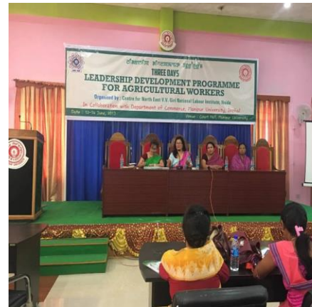
3-days leadership development program for agricultural workers