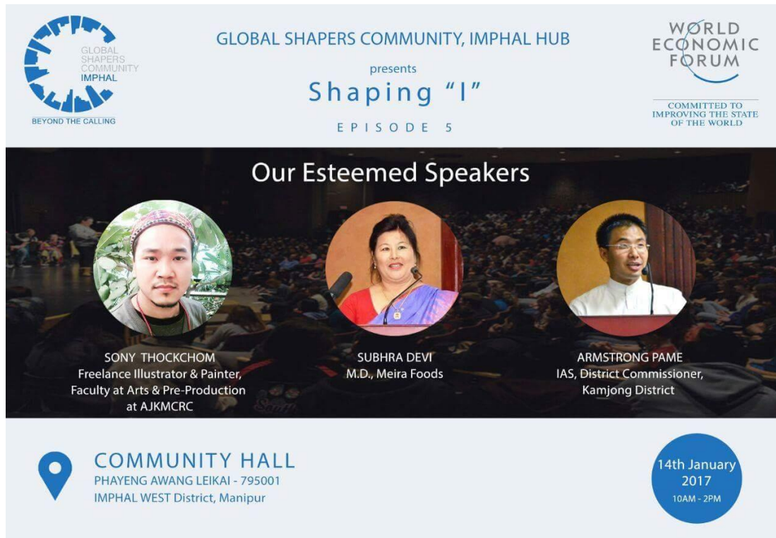
Proprietor of Meira Foods among the esteemed speakers