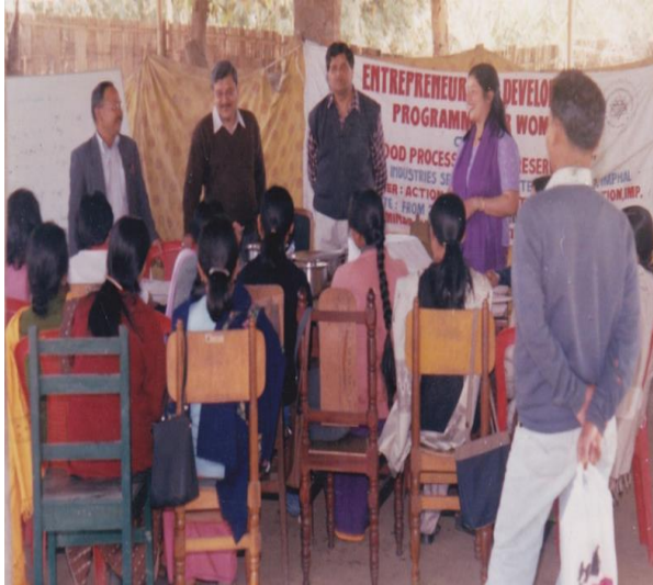
Entrepreneur Development Program for Women

Meira Foods not only imparts training to its employees within the industry itself but also imparts training to the interested people outside Meira Foods. With this, Meira Foods provides the people with the opportunity to start employing themselves by undertaking food processing business.