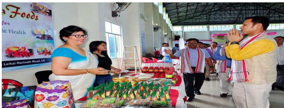
Interaction with Honorable Education Minister of Manipur Radheshyam.