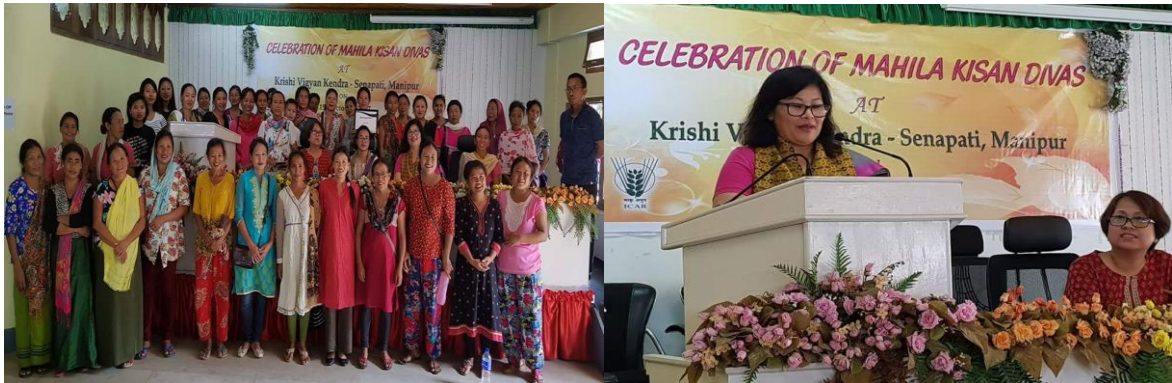
Celebration of Mahila Kisan Divas 2017