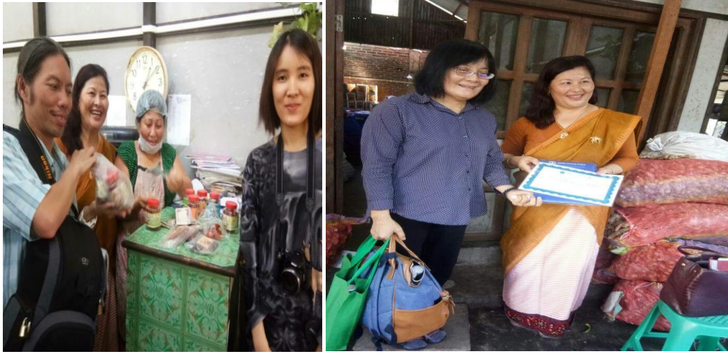
Professional visitors from Thailand