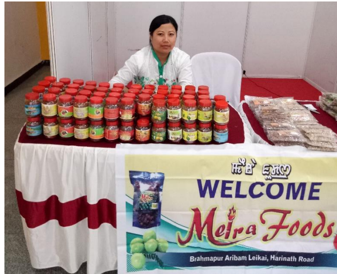
Meira Foods's stall in DIGI Dhan Mela