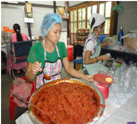
Meira workers packing pickles