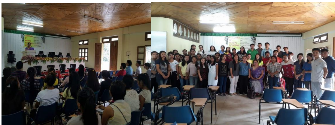
Meira Foods's participation in observance of National Nutritional week 2017