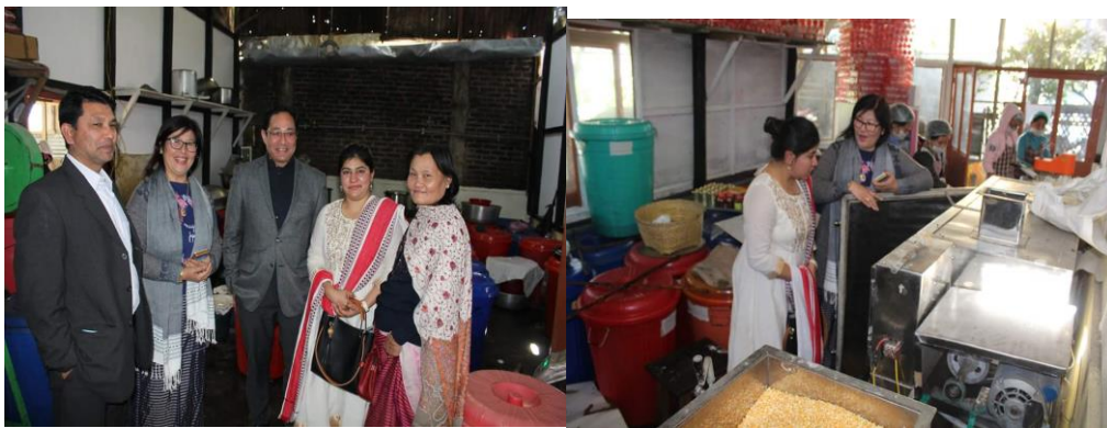
Officials from Ministry of Manipur Organic Mission Agency (MOMA) visiting Meira Foods