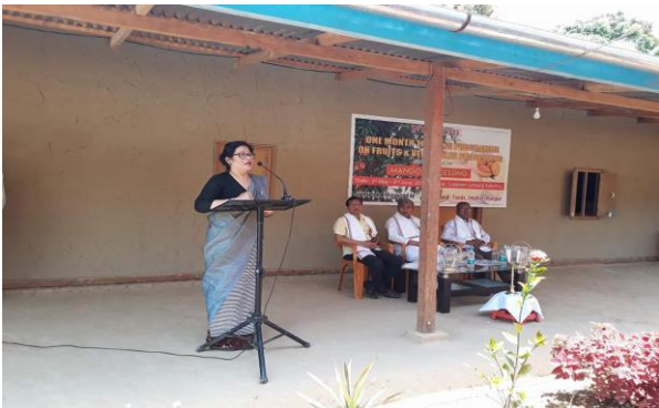
Proprietor of Meira foods giving speech during One-month training program on fruits and vegetables processing, 2 nd May to 2 nd June 2017