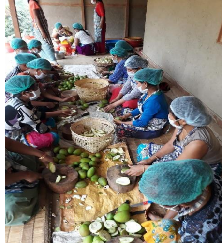
Training program at Kakching (Meira Foods's 3 rd unit )