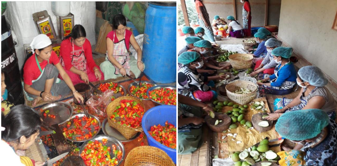
Meira Workers working with raw materials