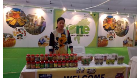
Meira Foods's stall in Vibrant NE 2017 Exhibition

Meira Foods has participated in the large exhibition which was a part of Vibrant North East-2017 held in Guwahati (Assam) from 4 th May to 6 th May. The event was jointly organized by Centre for Agriculture and Rural Development and the Associated Chambers of Commerce and Industry of India.