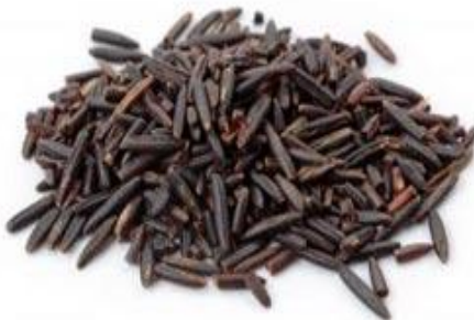
Dark Wild Rice