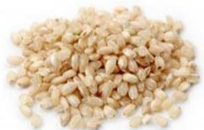
Brown Short Grain Rice

❖ WE SUPPLY ALL TYPE INDIAN RICES IN CUSTOMER REQUIREMENTS.