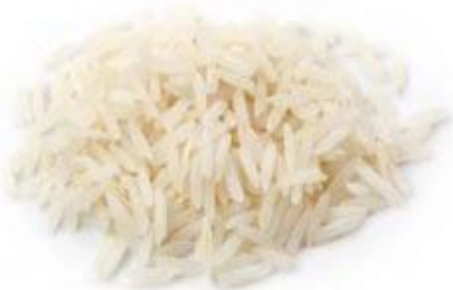
White Jasmine Rice