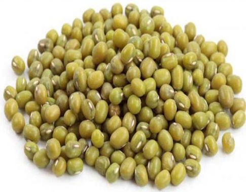
GREEN MOONG DAL