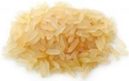
Parboiled Long Grain Rice