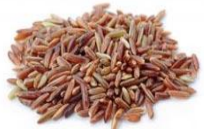
Red Cargo Rice