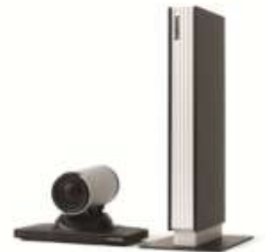
Cisco Edge MXP Series