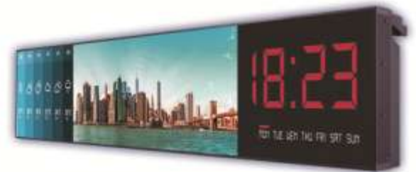
Ultra Stretch Commercial Display

Commercial Digital Signage is specially designed to maximize display utilization that creates greatest impact and practical convenience.