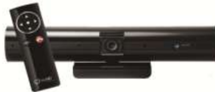
Tely HD pro