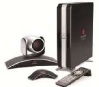
Polycom HDX 8000