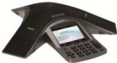
Polycom CX3000 IP Phone