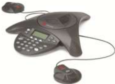
Polycom Sound Station VTX 1000