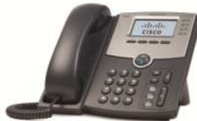
Cisco SPA504G 4-Line IP Phone